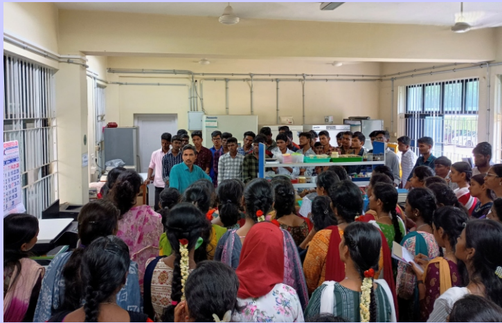
Visit of students from Forest College and Research Institute, Mettupalayam, visited ICFRE-IFGTB, Coimbatore

visited ICFRE-IFGTB, Coimbatore on 8 th , 9 th , 18 th and 19 th July 2024. They were briefed about research and development activities of the institute and lecture on Food and Environment were also delivered to participants.