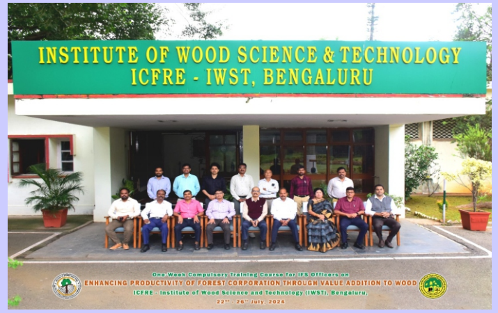
Training programme on “Enhancing Productivity of Forest Corporation Value Addition to Wood” by ICFRE-IWST, Bengaluru