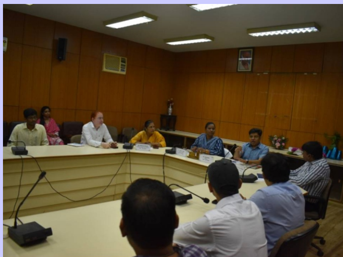
Workshop on "Assessment of Water requirement of different Forest Tree species and its impact on sub-soil moisture" by ICFRE-AFRI, Jodhpur