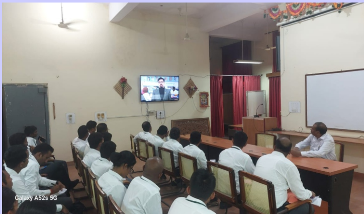
35 FRO trainees from Telengana State Forest Academy Dulapally, Hyderabad visited ICFRE-AFRI, Jodhpur

35 FRO trainees from Telengana State Forest Academy, Dulapally, Hyderabad visited ICFRE-AFRI, Jodhpur on 9 th July 2024. They were briefed about overview of the research activities of the institute, VMG of Shisham clone, Thar Shobha, Khejri and Guggal trials. Trainees also visited the Model Nursery and were explained about the various nursery techniques.