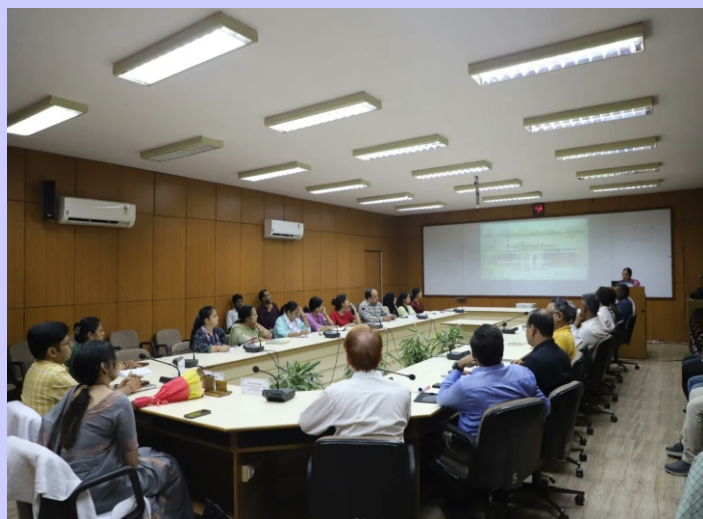
Workshop on "Plant Insect Interaction: Time to unlock Molecular Mechanisms" by ICFRE-AFRI, Jodhpur