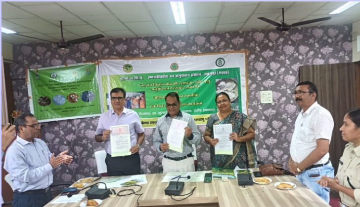
Signing of MoU between ICFRE-TFRI, Jabalpur and Chief Conservator of Forest, Indore, Madhya Pradesh