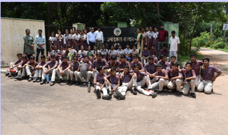
Visit of students from D.A.V. Anand Swami Public School, Hehal, Ranchi to ICFRE-IFP, Ranchi