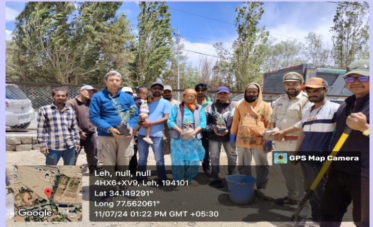
ICFRE-HFRI, Shimla organized a Plantation Activity at VVK, Badami Bagh, Leh

Leh. 12 participants from Skara Yokma panchayat participated in plantation activity & planted 20 seedling of Salix.