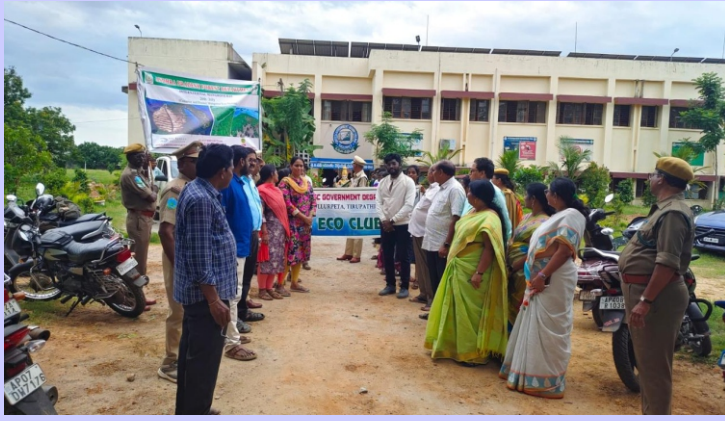
World Mangrove Day was celebrated by ICFRE-IFB, Hyderabad