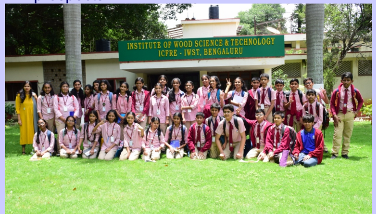
Visit of students from Mitra Academy, Arekere, Bengaluru to ICFRE-IWST, Bengaluru