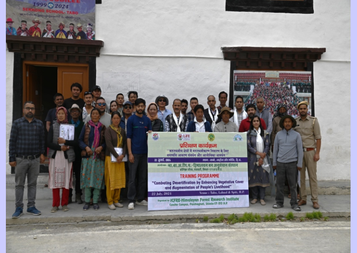
Training programme on “ Combating Desertification by Enhancing Vegetation Cover and People Livelihoods” by ICFRE-HFRI, Shimla