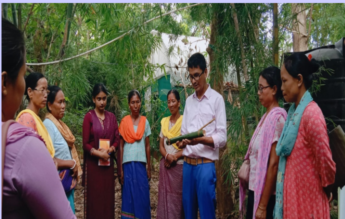
Training programme on “ Bamboo Propagation and Nursery Management” by ICFRE-RFRI, Jorhat