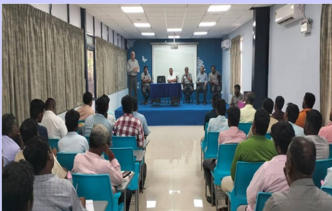
Training programme on “Plantation Management and Tree Genie” by ICFRE-IFGTB, Coimbatore