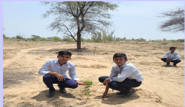
Students from Jawahar Navodaya Vidyalaya, Mohangarh, Jaisalmer participated in "Plantation Programme" organized by ICFRE-AFRI, Jodhpur