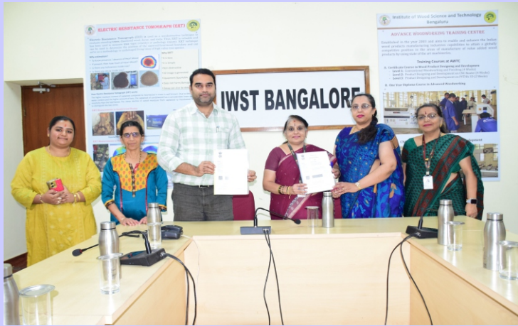
Signing of MoU between ICFRE-IWST, Bengaluru and Maharani Lakshmi Ammanni College for Women, Bengaluru