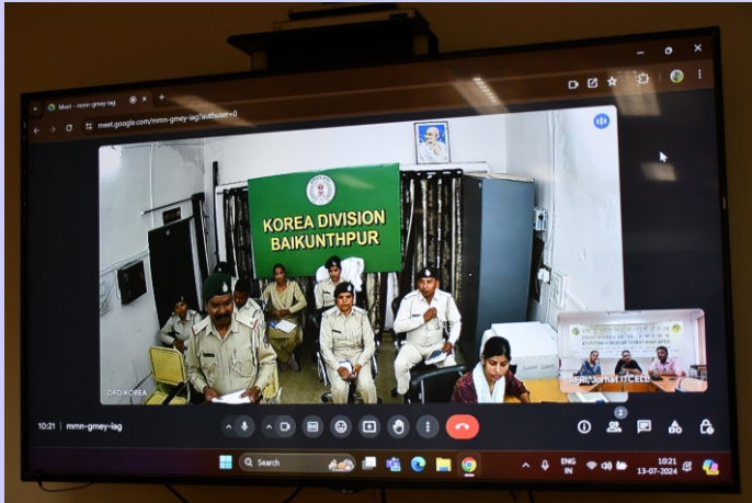
Training programme on “ Forest Seed technology & Nursery Management” by ICFRE-RFRI, Jorhat