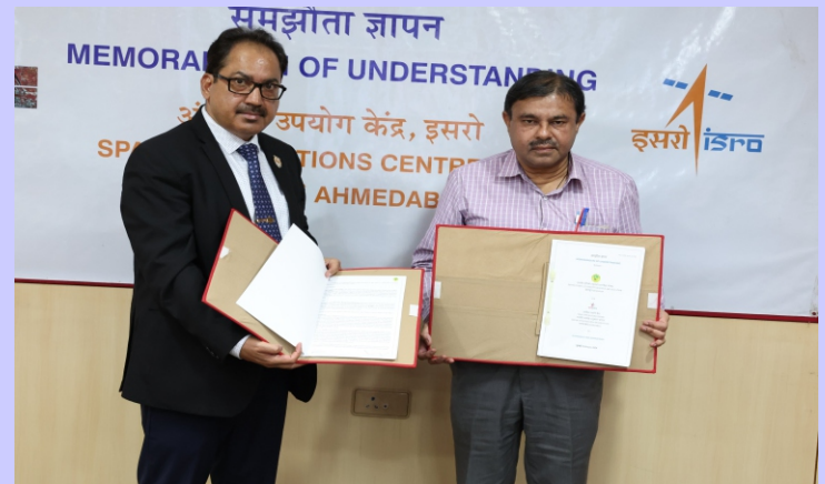
Signing of MoU between ICFRE(HQ) and Space Application Center, ISRO, Ahmedabad