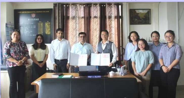
Signing of MoU ICFRE-BRC, Aizawl and Government Zirtiri Residential Science College, Durtlang