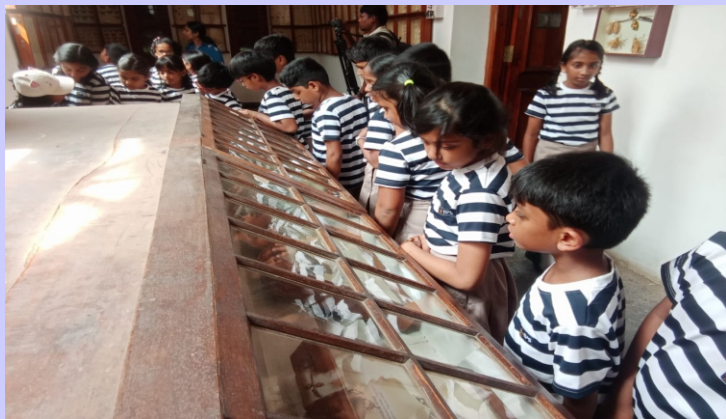
Visit of students from Indian Public School, Kavilpalayam to ICFRE-IFGTB, Coimbatore