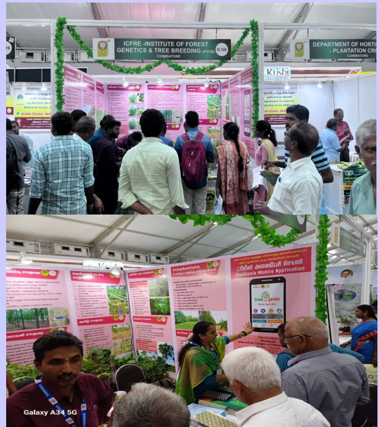
Stall by ICFRE-IFGTB, in 22 nd edition of India's Prime Agriculture Trade Fair, Coimbatore