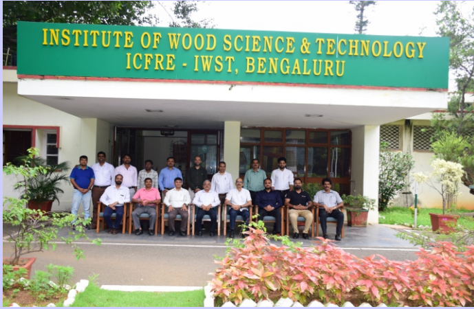
Training programme on “Wood based packaging materials” by ICFRE-IWST, Bengaluru