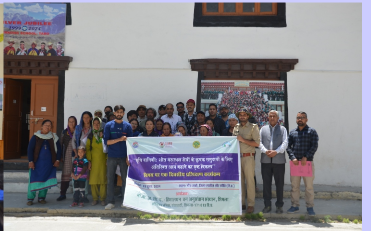
Training programme on “ Role of Agroforestry in trans Himalayan Cold Desert for Augmenting Additional income of local Communities” by ICFRE-HFRI, Shimla