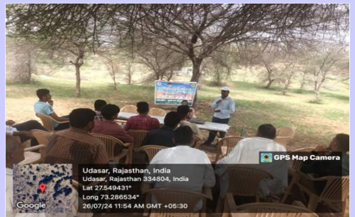
Training programme on “Process of plantation on sand dune and preparation of seedlings” by ICFRE-AFRI, Jodhpur