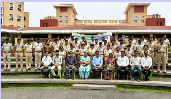
Training programme on “Seed Quality Assurance in Forestry Sector” under VVK by ICFRE-TFRI, Jabalpur