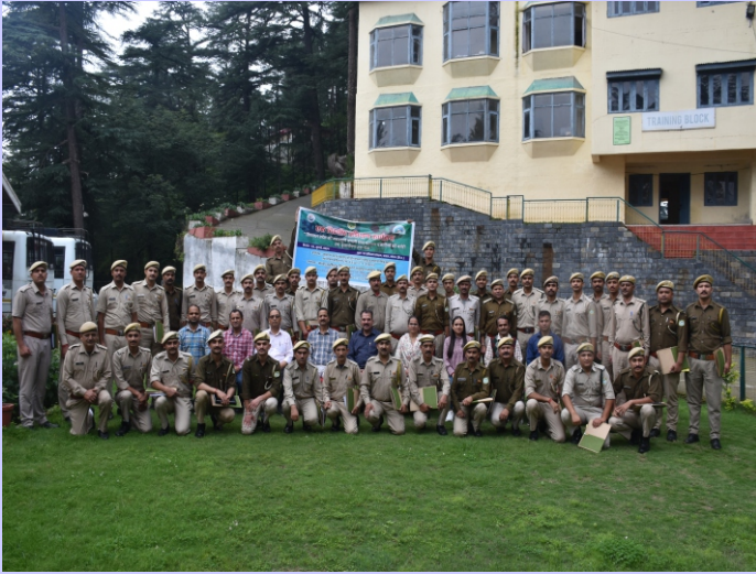
Training programme on “ Important Wild Edible Fruit Species of Himachal Pradesh” by ICFRE-HFRI, Shimla