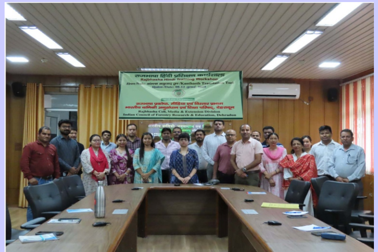
ICFRE, Headquarter organized a training on "Kanthasth Translation Tool"

(M&Extn.), ICFRE. 24 participants from ICFRE, Headquarter participated in training programme.