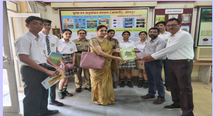
Visit of students from RSM International School, Sarabwati Nagar to ICFRE-AFRI, Jodhpur

International School, Saraswati Nagar, Jodhpur and Mahatma Gandhi Government School, Basini, Jodhpur visited ICFRE-AFRI, Jodhpur on 19 th July 2024.