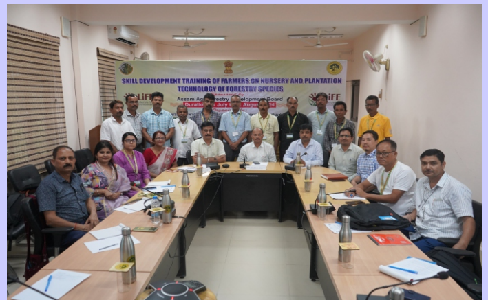
Training programme on “ Nursery and Plantation Technology of Forestry Species” by ICFRE-RFRI, Jorhat