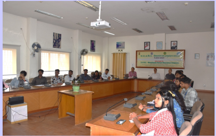
Visit of students from RABL College of Agriculture & Research Station, Chhuikhadan, Chattisgarh to ICFRE-HFRI, Shimla

were briefed about the Research and Development activities of the institute.