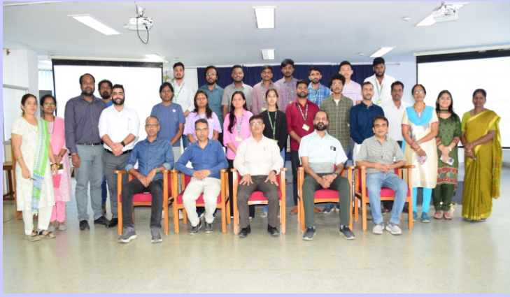
Visit of students from College of Forestry, SHUATS, Prayagraj to ICFRE-IWST, Bengaluru