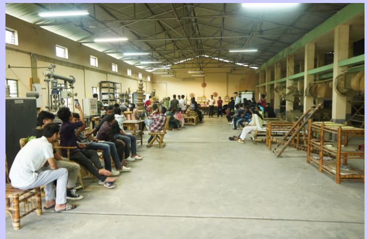
Visit of students from Assam Agriculture University, Jorhat visited ICFRE-RFRI, Jorhat