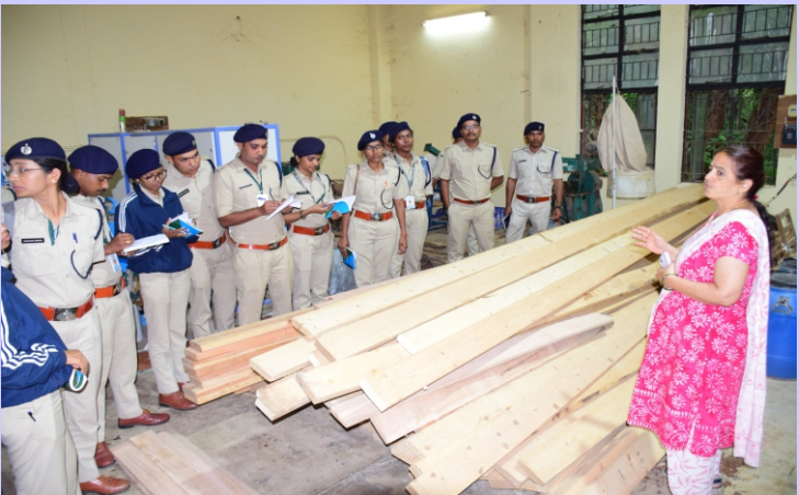
41 RFO trainees from Karnataka Forest Academy, Dharwad visited ICFRE-IWST, Bengaluru