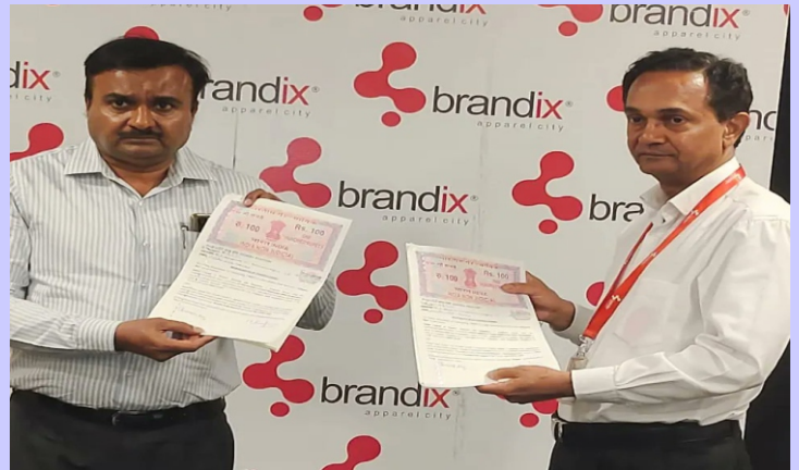
Signing of MoU between ICFRE-IFB, Hyderabad and Brandix India Pvt. Ltd., Visakhapatnam