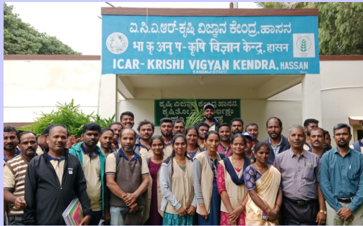
ICFRE-IWST, Bengaluru organized a training programme on “Sandalwood based Agroforestry Models & its Health” under VVK