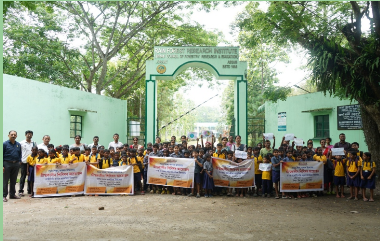
Group of 160 students visited ICFRE-RFRI, Jorhat