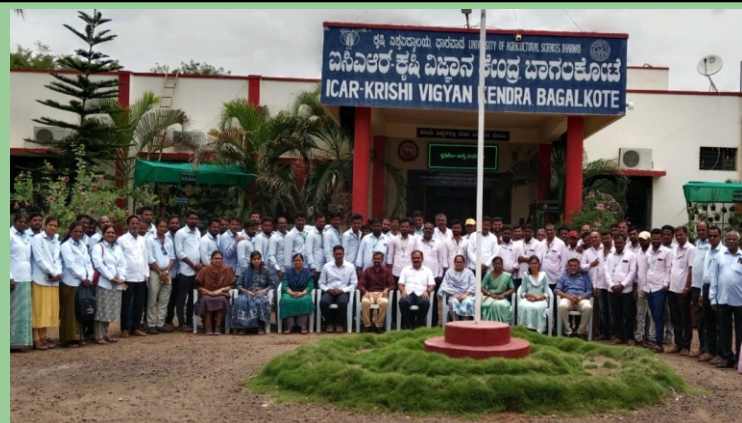
ICFRE- IWST, Bengaluru organized a training programme on “Sandalwood based Agroforestry Models & its Health” under VVK