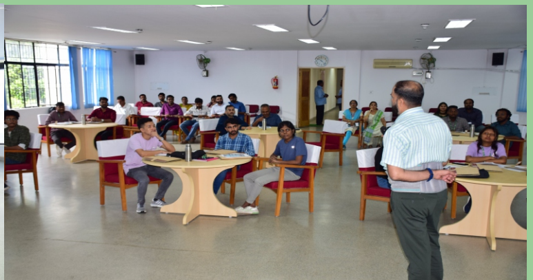
ICFRE- IWST, Bengaluru organized a training programme on “Wood science and technology”