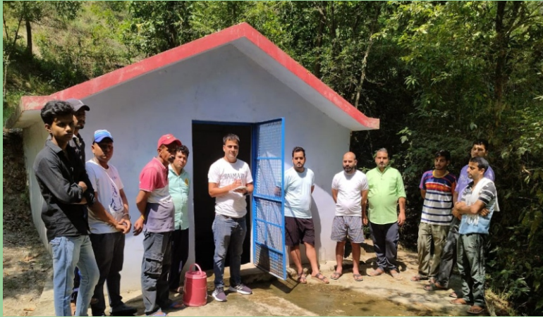
15 participants from Longi, Dharampur were made aware about saving water and rejuvenation of Bawari/Step wells through forestry interventions by ICFRE-HFRI, Shimla

participated in the event. They were made aware about saving water and rejuvenation of Bawari/Step wells through forestry interventions and their management on sustainable basis.