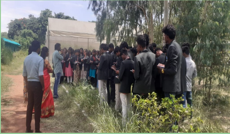
Students from SRS Institute of Agriculture & Technology, Dingigul visited ICFRE-IFGTB, Coimbatore