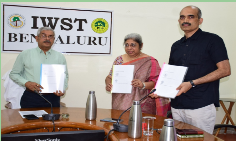
MoU signed between ICFRE-IWST, Bengaluru and Centre for Green Building Materials and Technology, Bengaluru