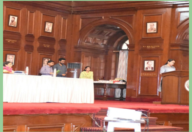
ICFRE-FRI, Dehradun organized a Painting and Kavita Path Competition