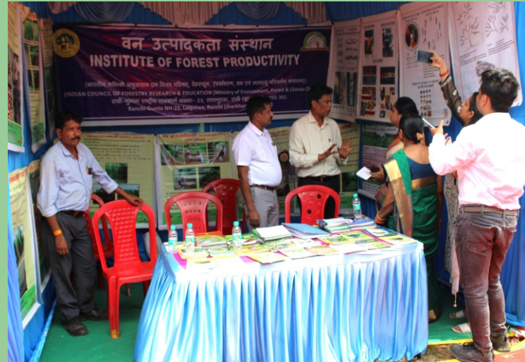
ICFRE-IFP, Ranchi installed a stall in 60 th Foundation Day organized by Central Tasar Research and Training Institute, Ranchi

Tasar Research and Training Institute, Ranchi on 19 th June 2024 at Central Tasar Research and Training Institute, Ranchi and showcased various Bamboo species, Poster of Bamboo Nursery Techniques, Bamboo introduction and Lac Production Techniques.