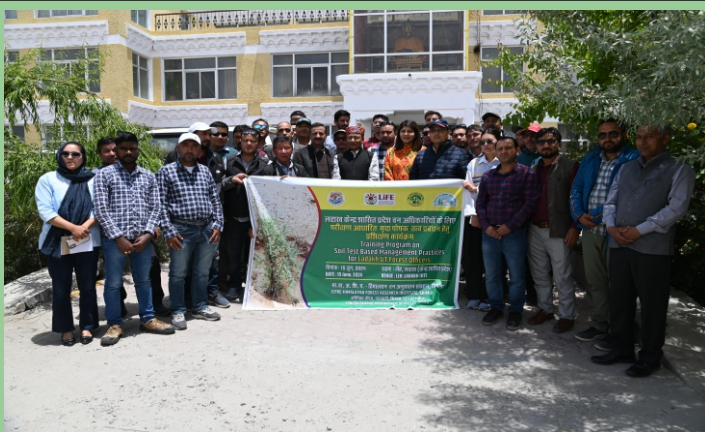
A training programme on “Promoting Soil Test Based Management Practices” by ICFRE- HFRI, Shimla