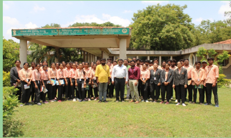
Students from Malla Reddy University Hyderabad participated in Awareness Programme organized by ICFRE-IFB, Hyderabad