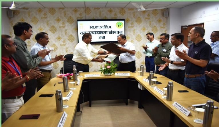
MoU signed between ICFRE-IFP, Ranchi and Damodar Valley Corporation, Koderma Thermal Power Station, Koderma, Jharkhand