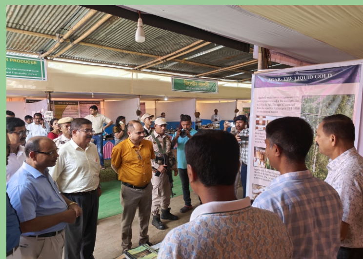
ICFRE-RFRI, Jorhat installed a stall in “Krishi Prajukti Pradarshani” organized by KVK, Jorhat