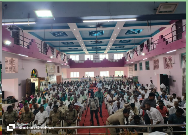
ICFRE- IFGTB, Coimbatore organized a meeting on “Popularizing Eucalyptus cultivation in dry lands for higher economic returns and TreeGenie App”