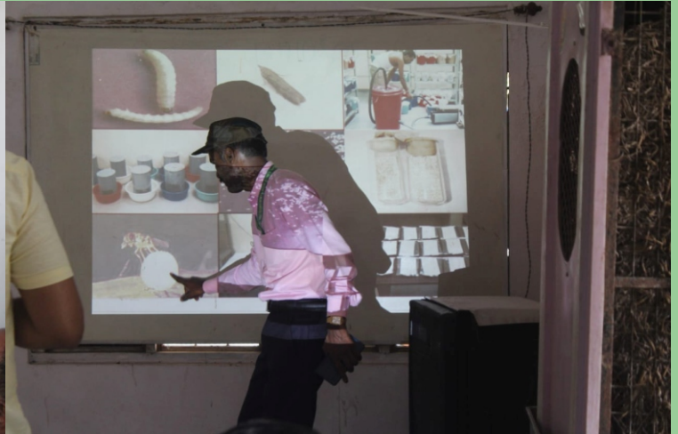
ICFRE- TFRI, Jabalpur organized a training programme on “Identification of Insect Pests in Forest Nurseries and Their Management”