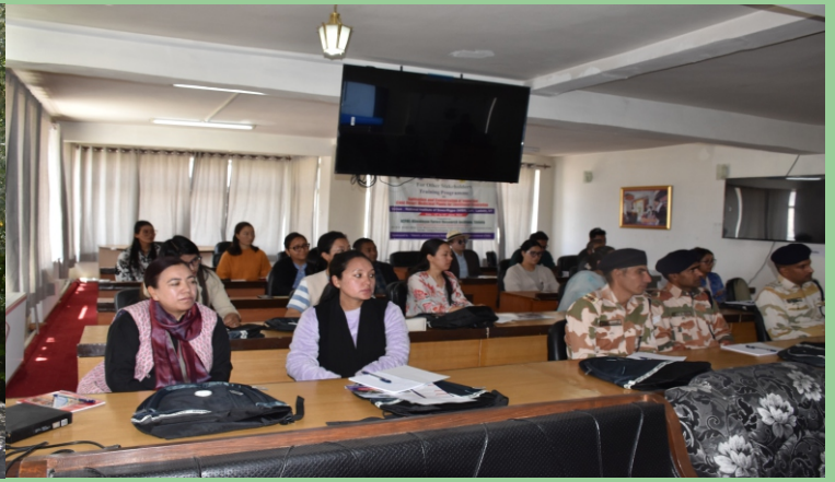
ICFRE- HFRI, Shimla organized a training programme on “Cultivation and Conservation of Important Cold Desert Plants”