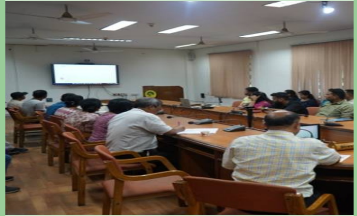
ICFRE-RFRI, Jorhat organized a hindi workshop on “Kanthasth 2.0 Translation Tool”