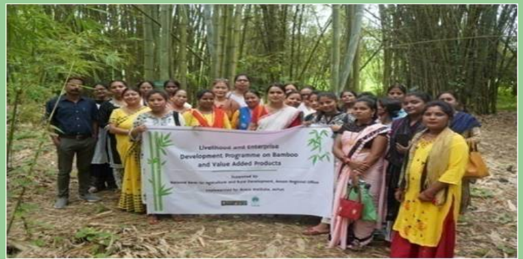
Training programme on “Livelihood and Enterprises Development Programme on Bamboo and Value Added Product” by ICFRE-RFRI, Jorhat