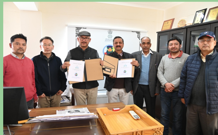
MoU signed between ICFRE-HFRI, Shimla and National Institute of Sowa Rigpa, Leh, Ladakh