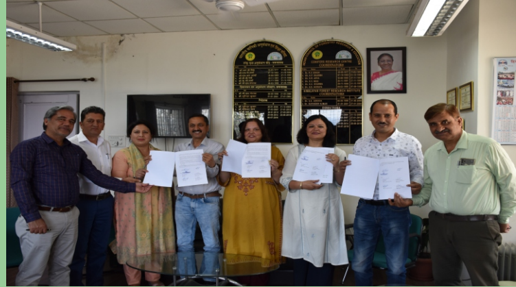
MoU signed between ICFRE-HFRI, Shimla and College of Excellence Government College, Sanjauli, Shimla