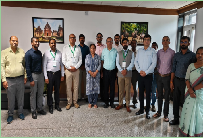
ICFRE, Headquarter organized a training programme on “Guiding Principles and implementation strategies of diversion conditions in mining projects under FC” at ICFRE-IFP, Ranchi