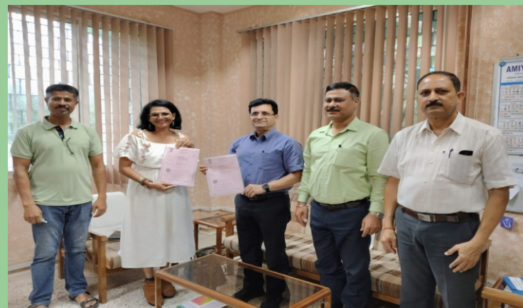
MoU signed between ICFRE-RFRI, Jorhat and Aaie Earth Initiatives Private Ltd.