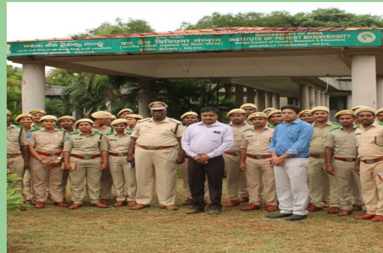
34 Forest Beat Officers from Telangana State Forest Academy visited ICFRE-IFB, Hyderabad