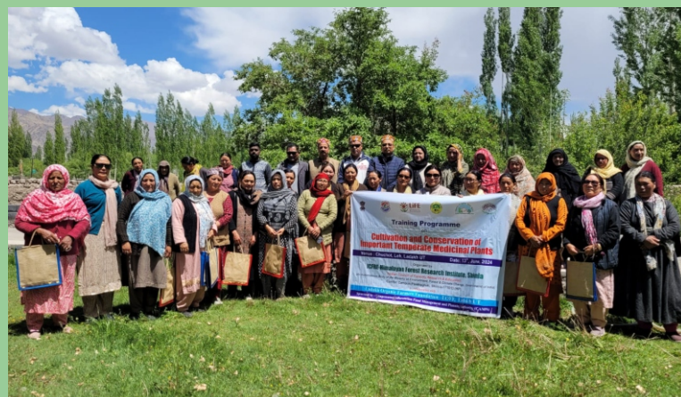
Training programme on “Cultivation and Conservation of Medicinal Plants by HFRI, Shimla