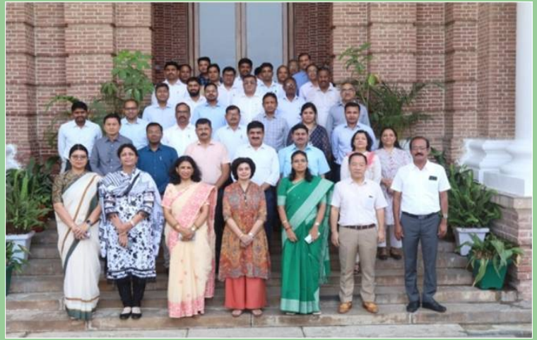
ICFRE-FRI, Dehradun organized a training programme on “Guiding Principles for Processing for FCA Projects”