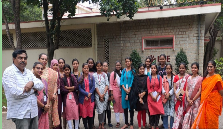
Students from Forestry College, Ponnampet and Maharani Laxshmi Ammsani College, Bengaluru visited ICFRE-IWST, Bengaluru