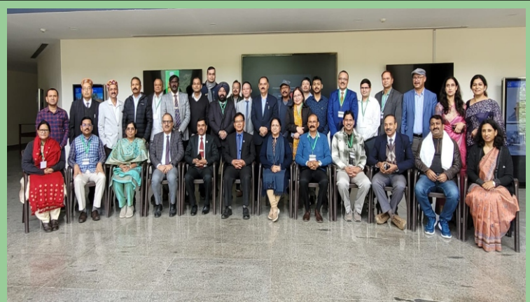
Training programme on “Ecotourism as sustainable Livelihood” by ICFRE-HFRI, Shimla by ICFRE-HFRI, Shimla