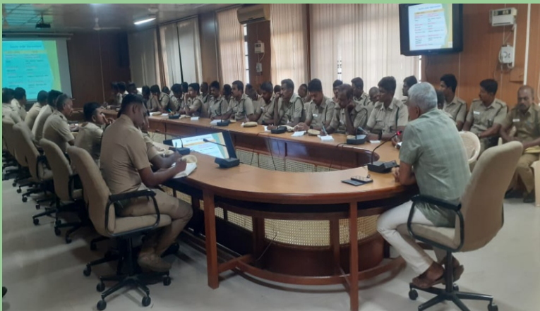
64 Forest Guards from Tamil Nadu Forest Department visited ICFRE-IFGTB, Coimbatore