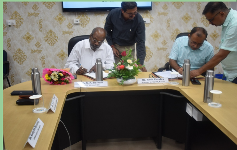
MoU signed between ICFRE-IFP, Ranchi and Steel Authority of India Limited, Meghahatuburu, West Singhbhum, Jharkhand