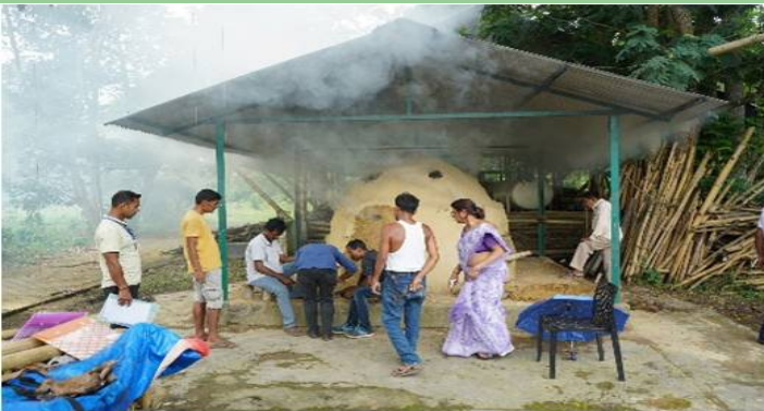
Training programme on “Bamboo Charcoal and briquette Making” by ICFRE- RFRI, Jorhat