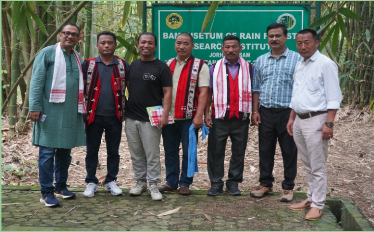
Dignitaries from Empretec India Foundation, Nagaland visited ICFRE-RFRI, Jorhat