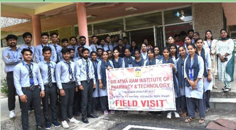
Students from Atma Ram Institute of Pharmacy, Jabalpur visited ICFRE-TFRI, Jabalpur