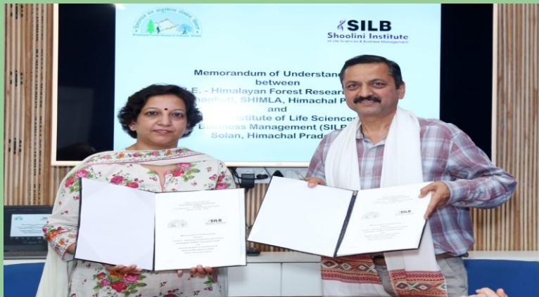
MoU signed between ICFRE-HFRI, Shimla and Shoolini Institute of Life Science and Business Management, Solan

new generation of highly skilled human resource providing entirely new opportunities for employment and economic development with focus on environment, bio-resources, skill development, livelihood opportunities, science and technology, biotechnology, health and wellness lifestyle domain of North West Himalayan region.