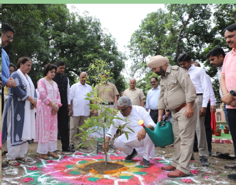
Inauguration of Ek_Ped_Maa_Ke_Naam Campaign by Hon'ble Minister of Environment, Forest and Climate Change Sh. Bhupender Yadav