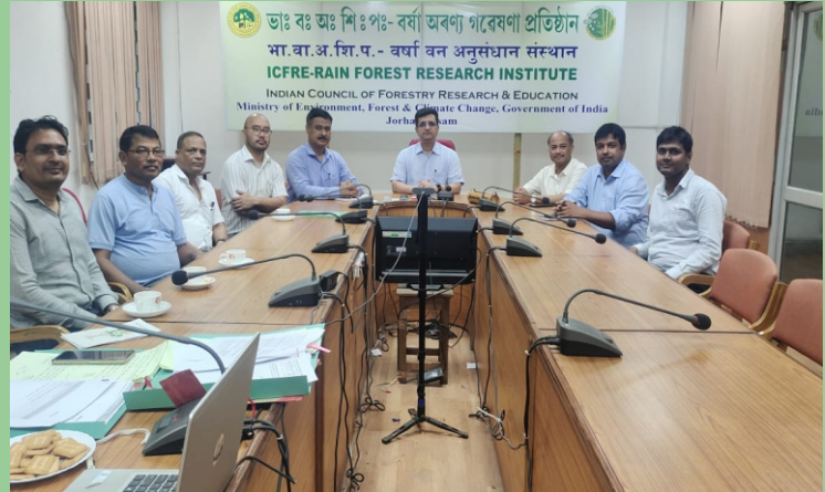
ICFRE-RFRI, Jorhat organized a hindi workshop on “Quarterly Official Language Implementation Committee”