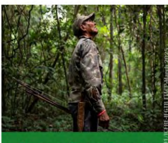
Serve as food safety nets in times of crisis

"Forests & Foods: Rooted in Nature, Feeding the Future"