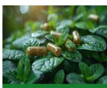
Vital sources of medicine