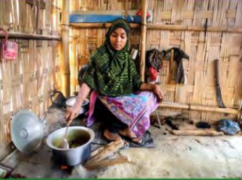
2 billion peoples rely on wood and other traditional fuel for cooking