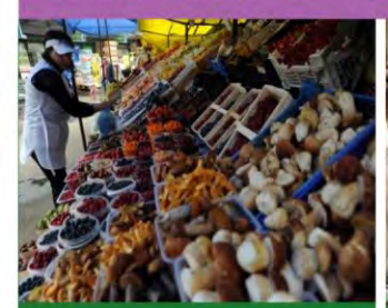
Provides foods for billions of people

Forests sustain life, nourish communities and safeguard our future