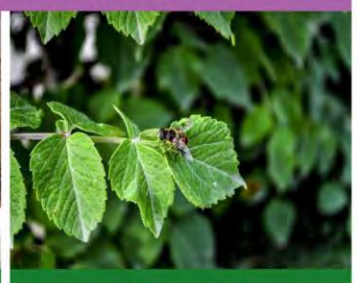
Crucial for agriculture