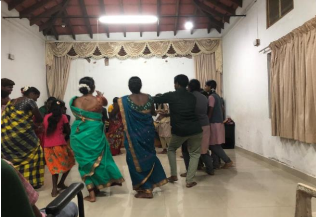
Cultural program by ATR Tribal Artists