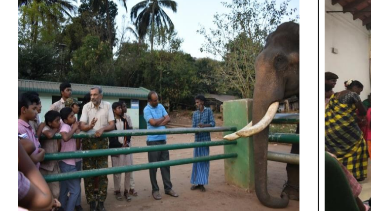
Students at Elephant camp