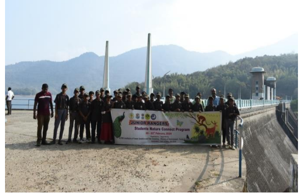
Visit to reservoirs – Thunakkadavu & Parambikulam Dam