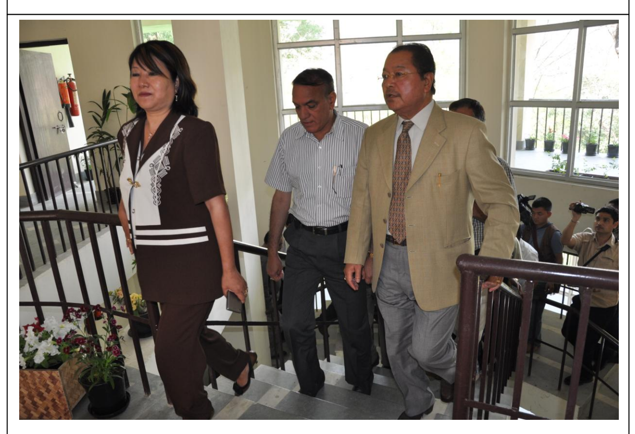
Pu Lal Thanhawla, the Hon'ble Chief Minister of Mizoram inspecting the ARCBR Building Complex