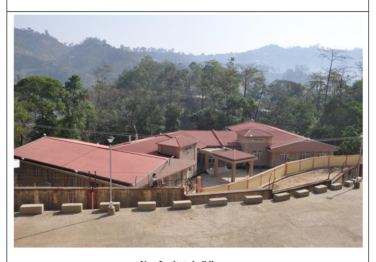
New Institute building