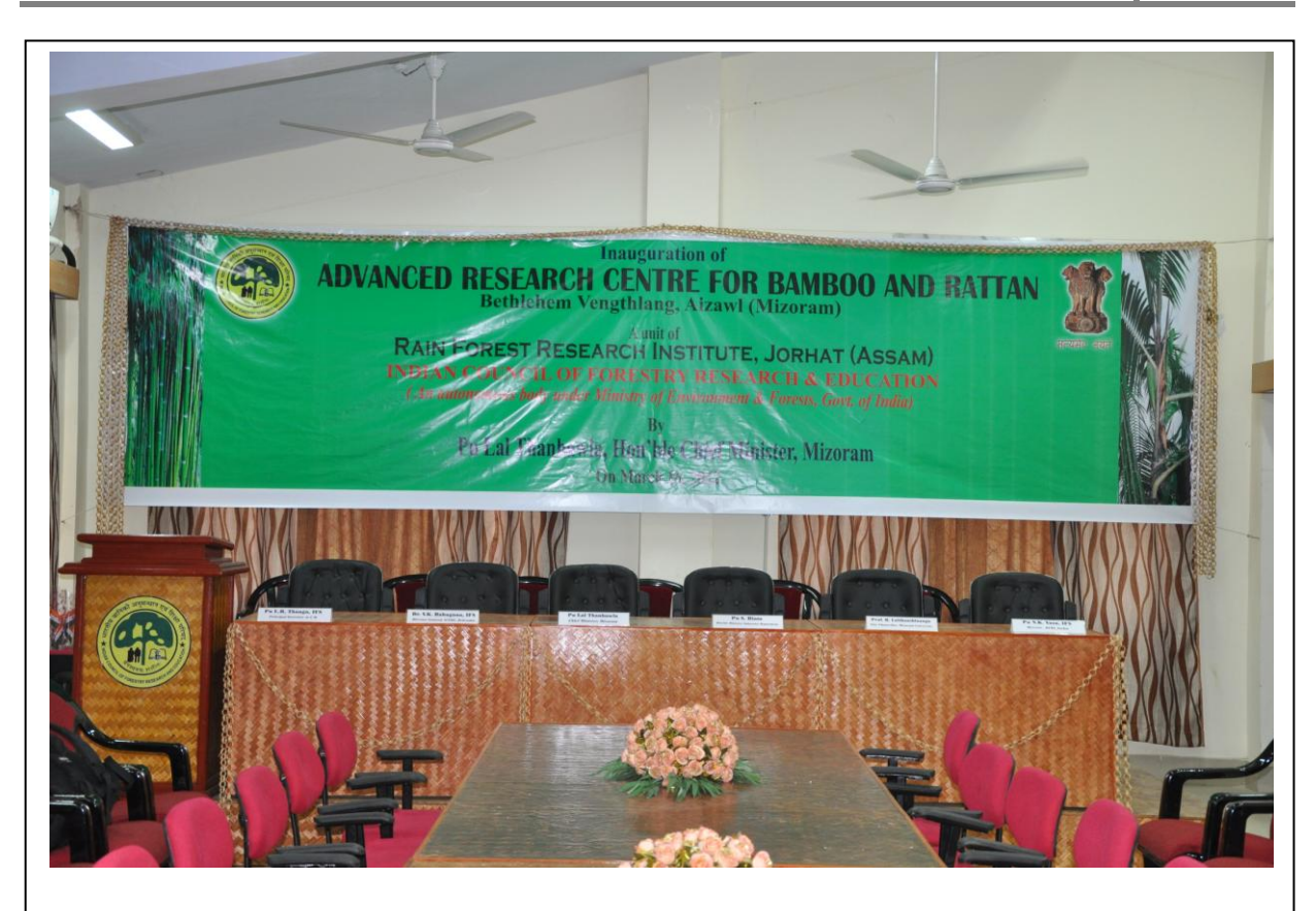
Banquet Hall waiting to receive the distinguished guests