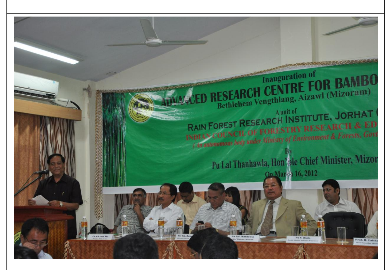
Pu S. Hiato, the Hon'ble Minister of Industries, Mizoram delivering his speech