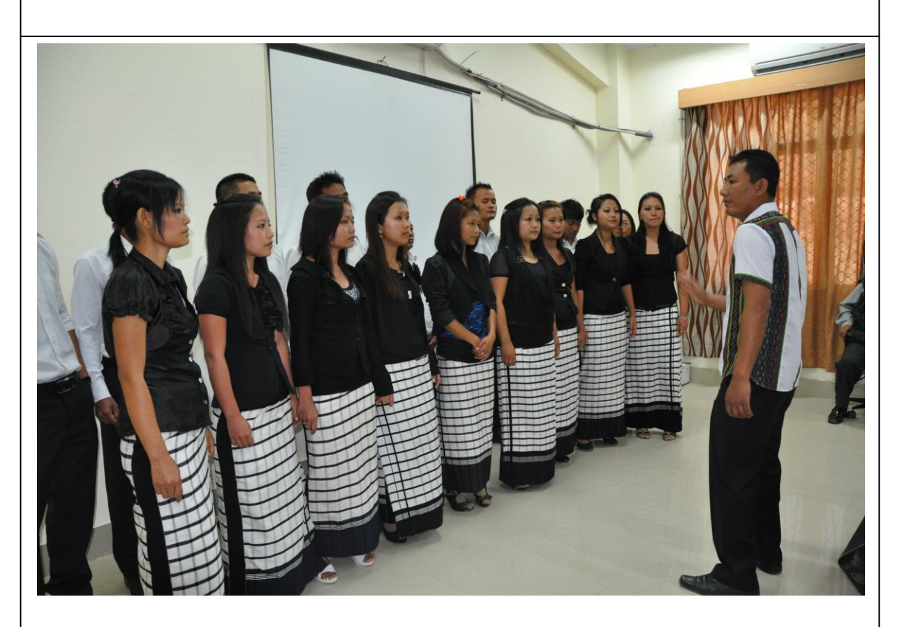
Welcome Song performed by Young Mizo Association Choir, Bawngkawn Branch