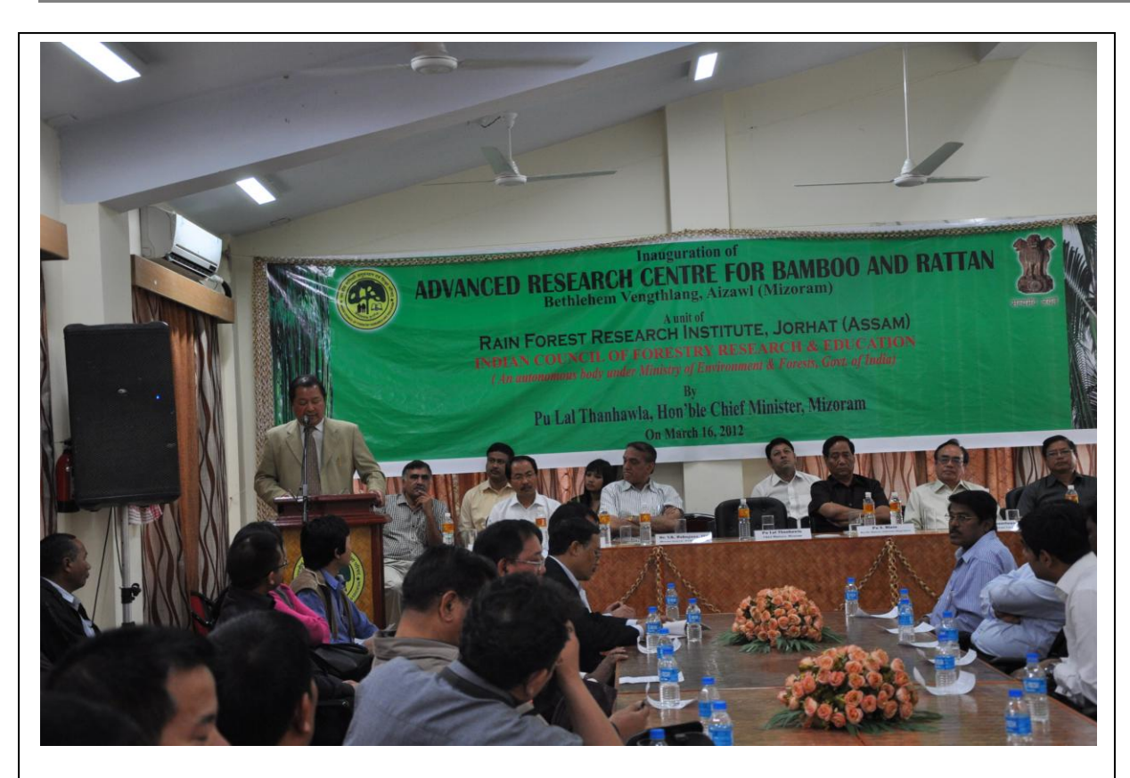
Pu Lal Thanhawla, the Hon'ble Chief Minister of Mizoram delivering his inaugural address