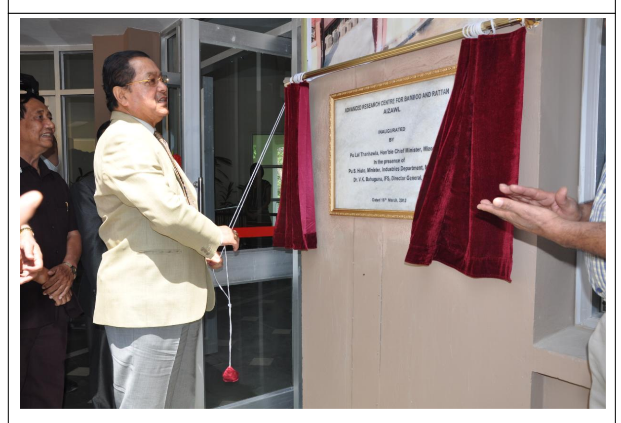
Pu Lal Thanhawla, the Hon'ble Chief Minister of Mizoram inaugurating the ARCBR Complex