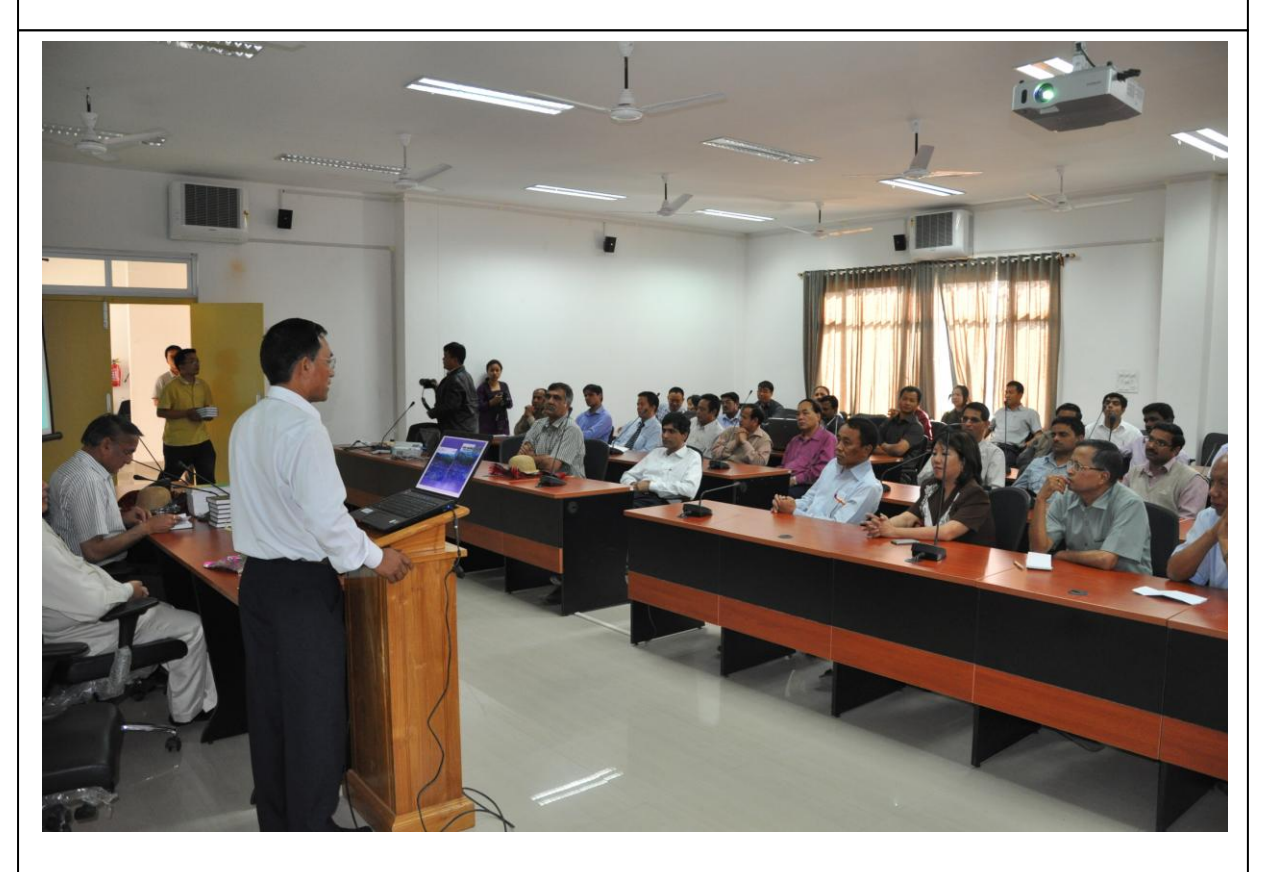
A section of Faculty members, researchers and others