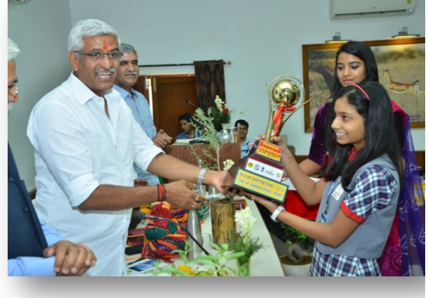
First prize winner of Junior group