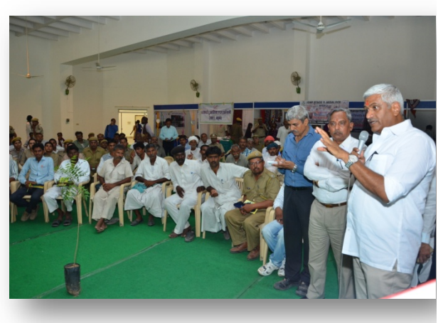
Honorable MP, Jodhpur addressing the trainees