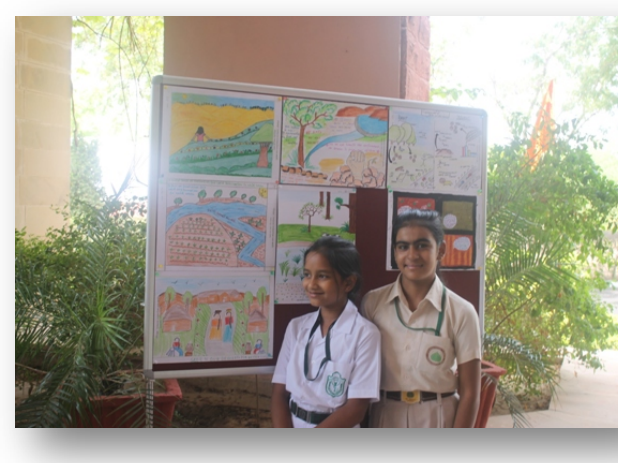
Display of paintings