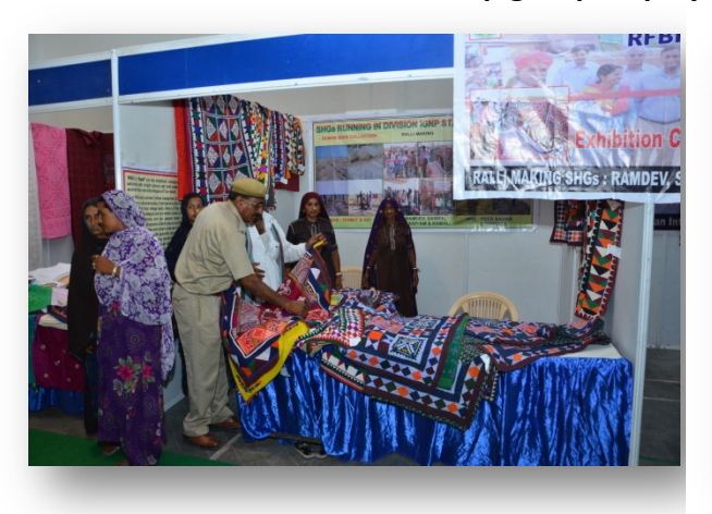
Self help group from Jaisalmer