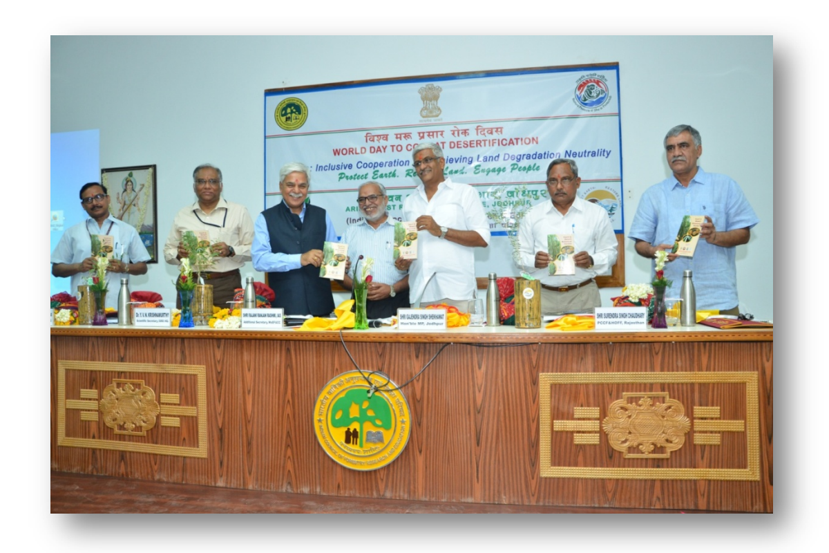
Inauguration of the book entitled "Cacti in Desert botanical Garden"