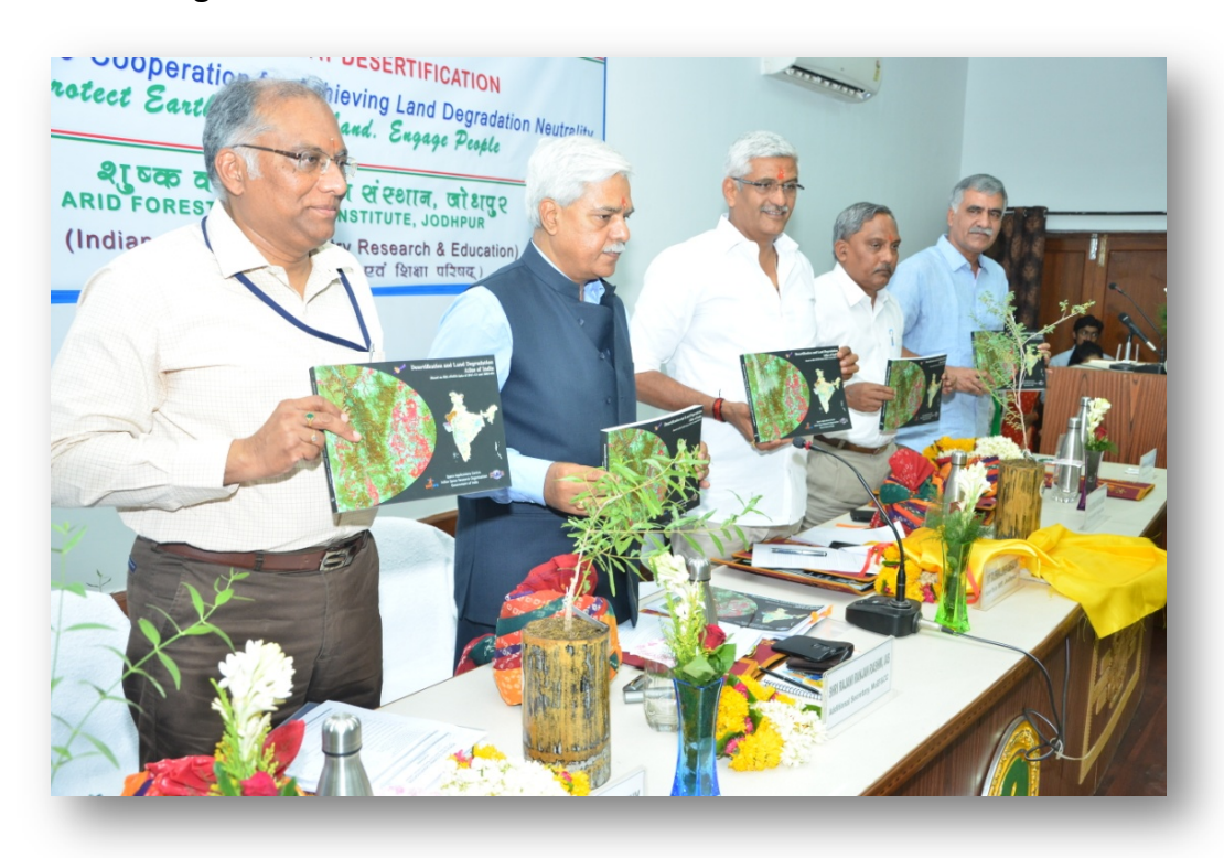
Inauguration of Desertification and Land Degradation Atlas of India