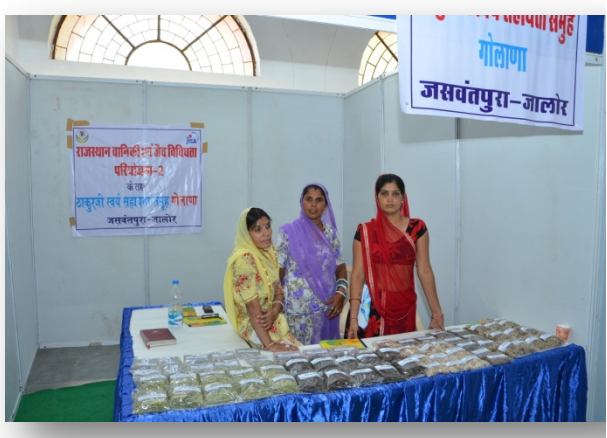
Self help group displaying their products