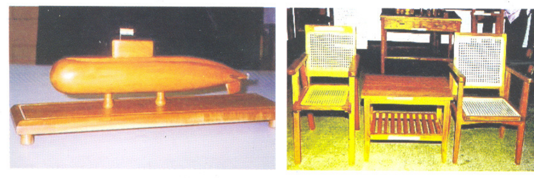
A model prepared using A. auriculaeformis.

Findings: Acacia auriculaeformis (age, 8-13 years; average girth 42 to 60 cm) evaluated for anatomical and strength properties. Except fibre length (830-989 \mu m), other anatomical properties shown marginal differences with age. Wood is suitable for pulp and paper, furniture and handicrafts. The suitability indices of 13 years aged timber is very heavy, very strong, moderately tough, hard and a steady, suitable for tool handles, oars and paddles, sleepers, construction, furniture and packing cases/ammunition boxes.