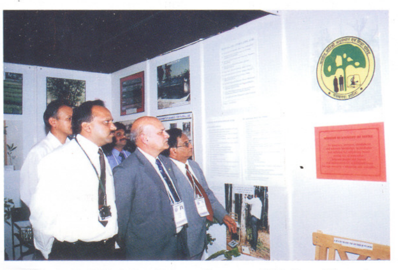
Participated in 90th Indian Science Congress Exhibition at Bangalore from 3rd - 7th January, 2003.