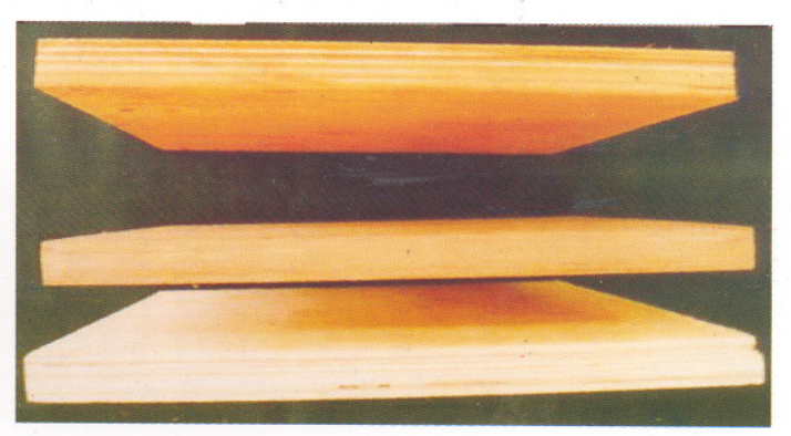
LVL made of neem, gurjan and muruku

Findings: LVL samples from 1 to 1.5 inches thickness were prepared from gurjan ( Dipterocarpus indicus ), muruku ( Erythrina stricta ), mango (mangifera indica ), neem ( Azadirachta indica ), neem ( Azadirachta indica ) and dido ( Bombax insigne ) by mixing the veneers in different