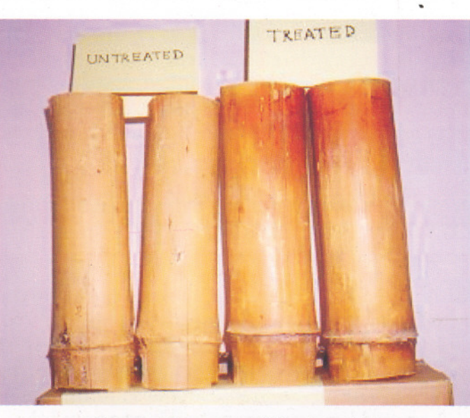
Chemical Seasoning of Bambusa tulda

Chemical seasoning of round B. tulda in green condition with 30 % aqueous solution of urea (w/v) mixed with 3 % aqueous solution of boric acid (w/v) at 45^{\circ}C temperature, used as antishrink and antifungal treatment, enabled forcedair-drying of the bamboo with negligible drying degrades, whereas the untreated bamboo showed drying degrades unacceptable for its use in round form.