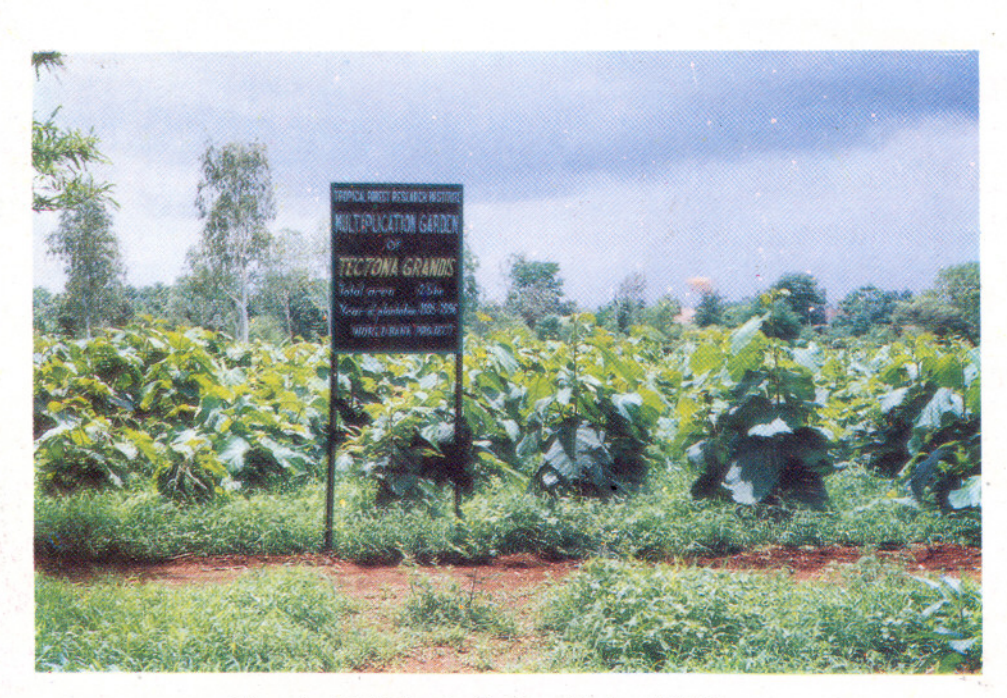
Vegetative Multiplication Garden of Teak at TFRI Campus