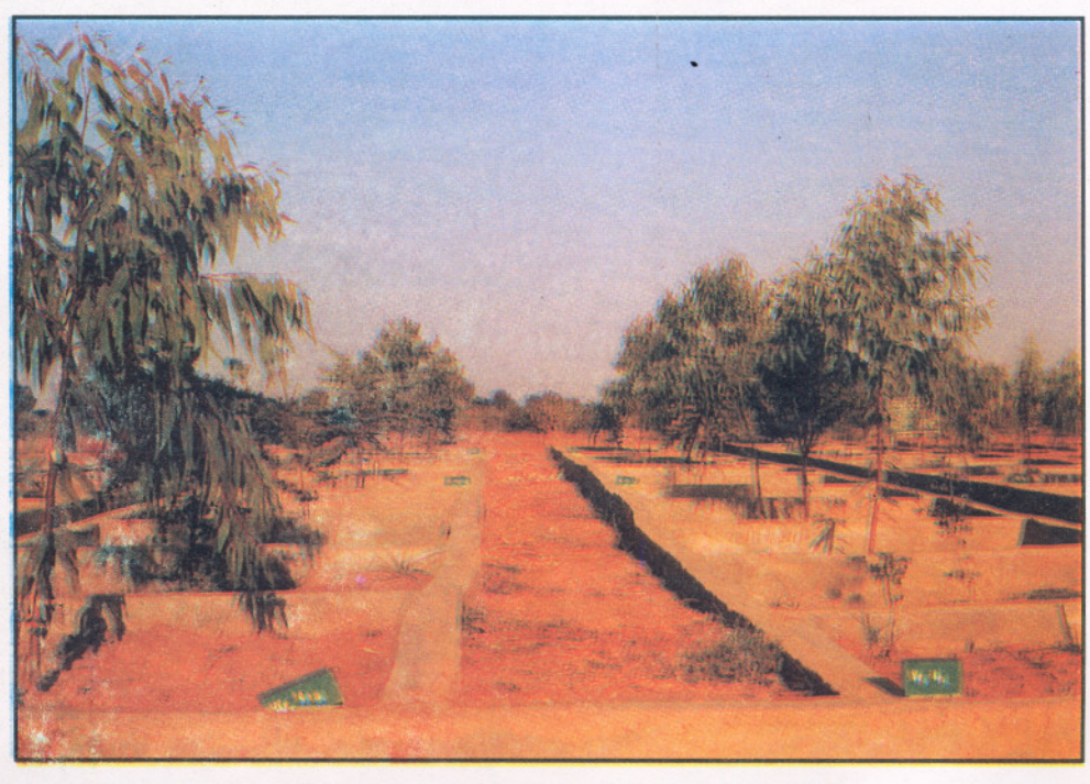
Lysimetric studies on woody plant water relation in arid zone