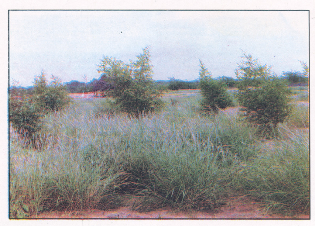
Silvipasture studies in arid zone