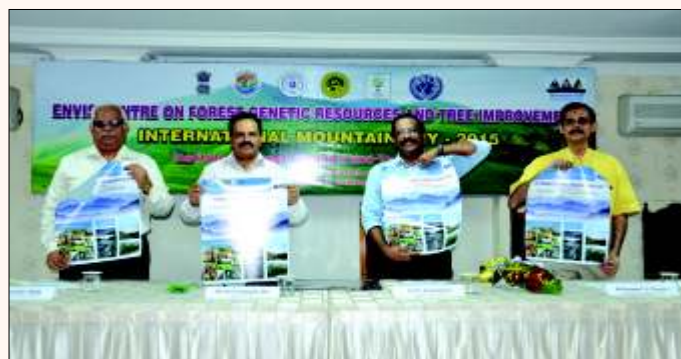
International Mountain Day celebration at IFGTB, Coimbatore