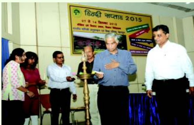
DG, ICFRE lighting the lamp during Hindi Week closing ceremony at ICFRE, Dehradun