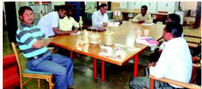
An exposure visit to NID, Ahmadabad organized by BTSG-ICFRE