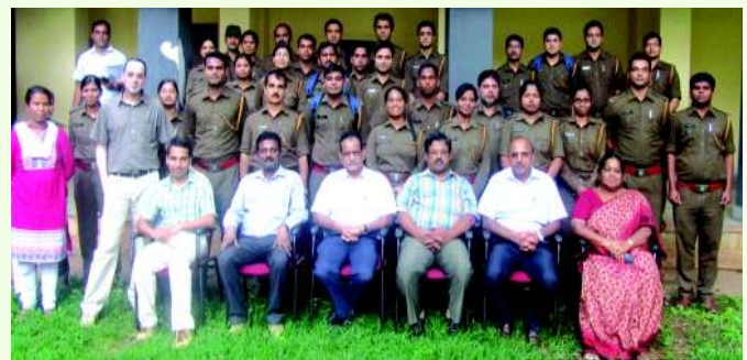
IWST, Bengaluru organized Training programme for Forest Range Officer Trainees on Wood Science and Technology