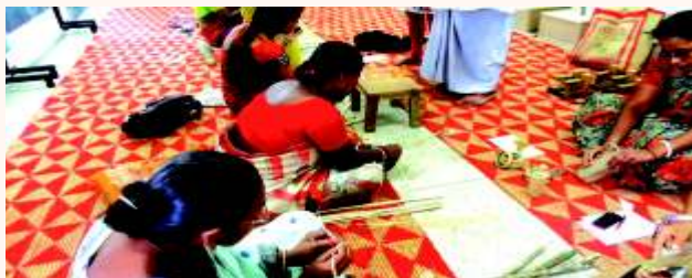
Workshop organized by CFLE, Agartala on Bamboo Propagation, Preservation and Value Addition for skill upgradation and entrepreneurship development