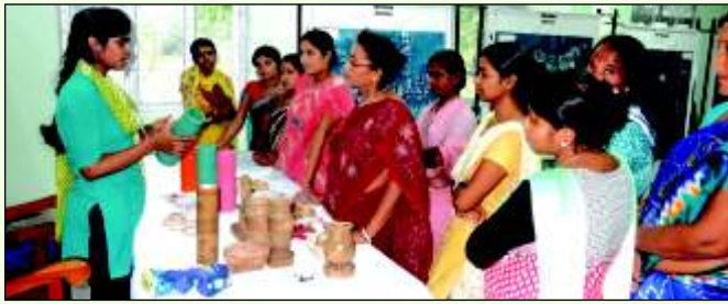
Training on Bamboo propagation, preservation and value addition organised by CFLE, Agartala