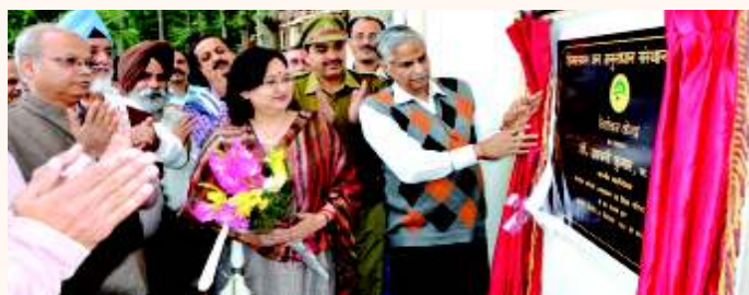
Inauguration of Interpretation Centre at HFRI, Shimla by DG, ICFRE