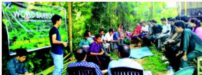
Celebration of World Bamboo Day at Noagaon, Tripura by CFLE, Agartala