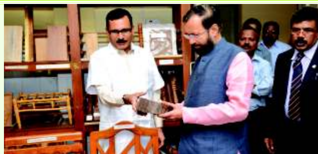
Visit of Shri Prakash Javadekar, Hon'ble Minister of State (Independent Charge) of Environment, Forest & Climate Change, to IWST, Bengaluru