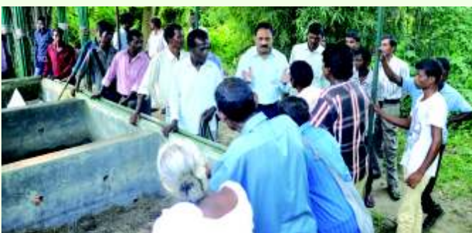
Training programme on lac cultivation, techniques of bamboo propagation etc organised by RFRI, Jorhat.