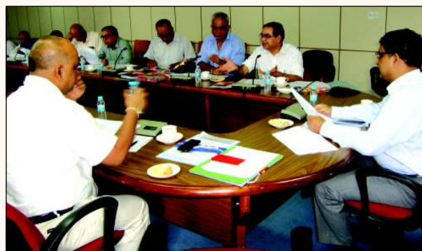
Working group meeting of CEIA Study of Sutlej Basin H.P. at ICFRE, Dehradun