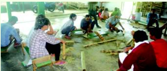
Training-cum-workshop on Bamboos Handicraft organised by RFRI, Jorhat