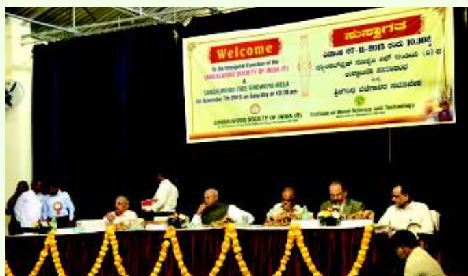
Sandalwood Growers Meeting organized jointly by IWST, Bengaluru & Sandalwood Society of India