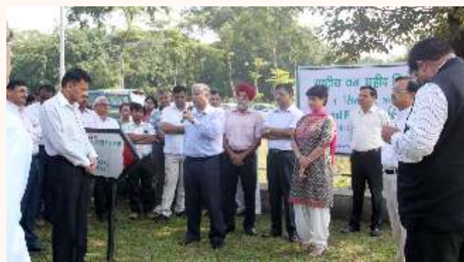
Celebration of Forest Martyrs Day at FRI, Dehradun