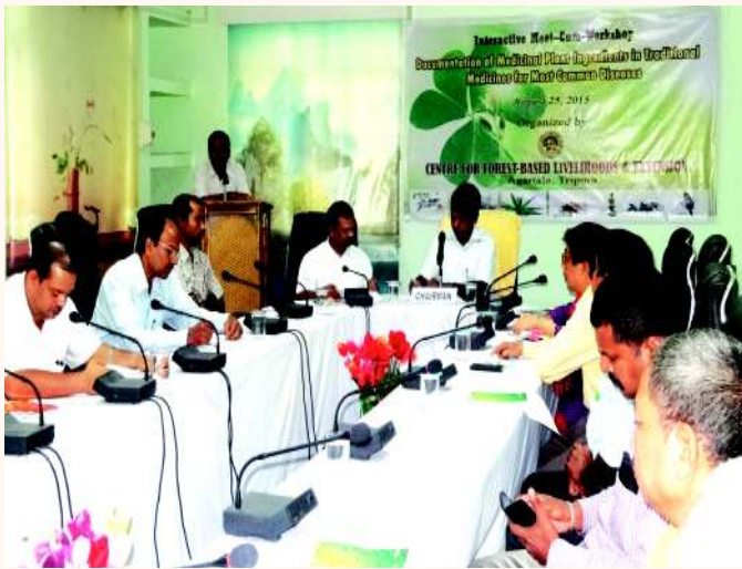
Meeting-cum-workshop organised by CFLE, Agartala on Documentation of Medicinal Plants Ingredients in curing 10 most Common Diseases