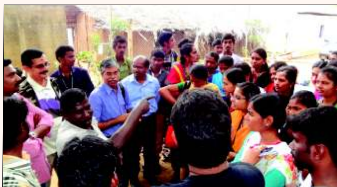
International Day of the World's Indigenous People observed at IFGTB, Coimbatore