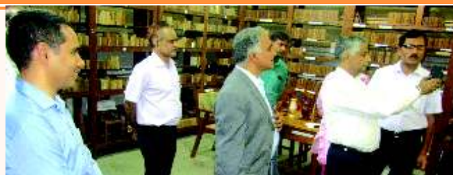
Visit of DG, ICFRE to IWST, Bengaluru