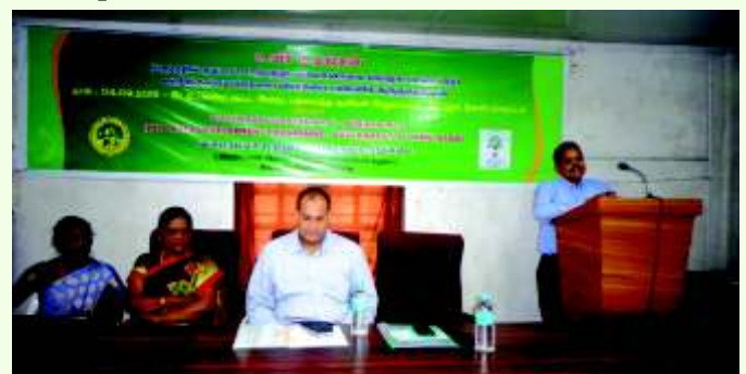
Training-cum-demonstration on Bio-fertilizer Production and Application Methods in Nursery and Field by IFGTB, Coimbatore