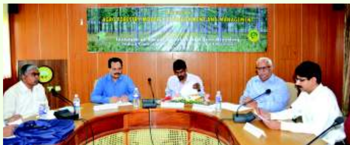
Training on Agro-forestry models-establishment and management at IFGTB, Coimbatore

from KVK, Tamil Nadu Agricultural University and Agriculture Officers from the Agriculture Department participated in this training.