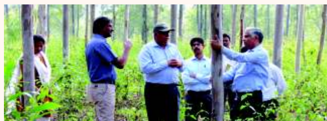
Visit of DG, ICFRE to IFGTB, Coimbatore