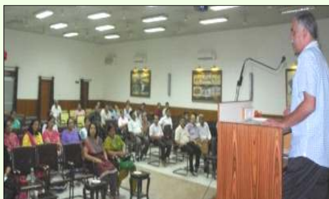
Celebration of Hindi fortnight at AFRI, Jodhpur