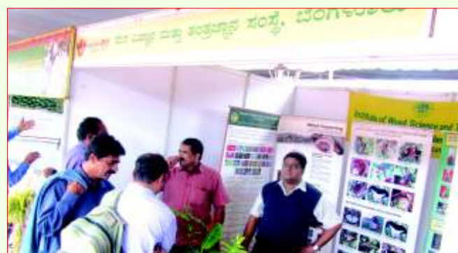
IWST, Bengaluru participated in Krishimela 2015