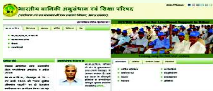
New Hindi website of ICFRE similar to English website