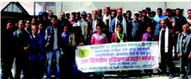
Training & demonstration Programme on cultivation of important temperate medicinal plants by HFRI, Shimla