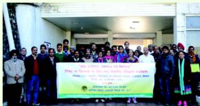
Training programme on Bamboo Production, Management and Marketing organized by HFRI, Shimla