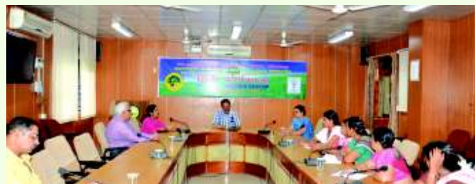
Hindi Workshop at IFGTB, Coimbatore