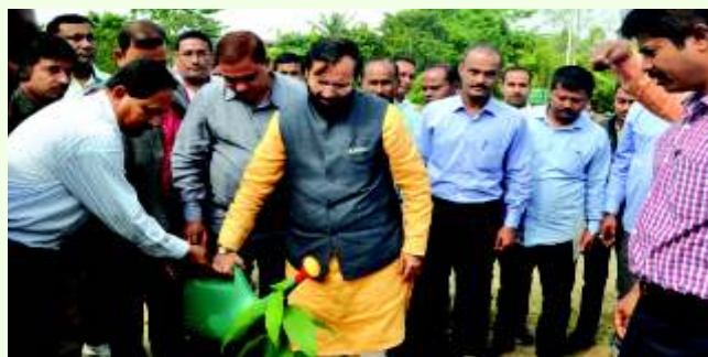
Visit of Shri Prakash Javadekar, Hon'ble Minister of State (Independent Charge) of Environment, Forest & Climate Change, to RFRI, Jorhat