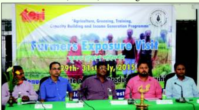
Exposure visit of farmers at IFP, Ranchi