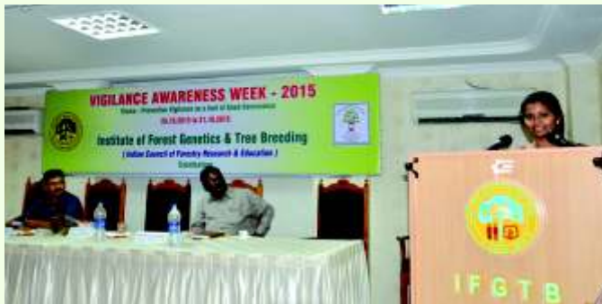
Vigilance Awareness Week celebration at IFGTB, Coimbatore