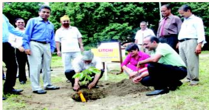
Van Mahotsava celebration at FRI, Dehradun