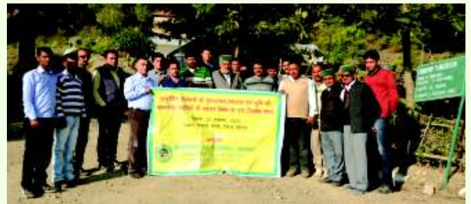
Training programme on Cultivation of Medicinal Plants at HFRI, Shimla