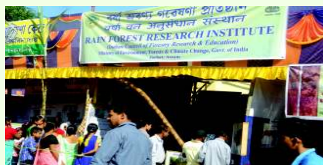
Farmers' Meet organized by RFRI, Jorhat