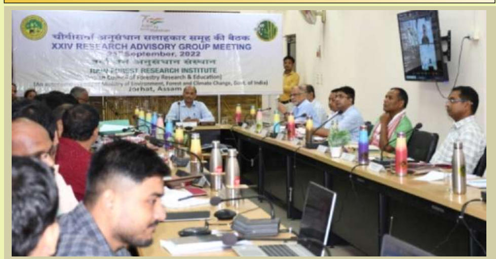
RFRI, Jorhat organized Research Advisory Group Meeting 2022