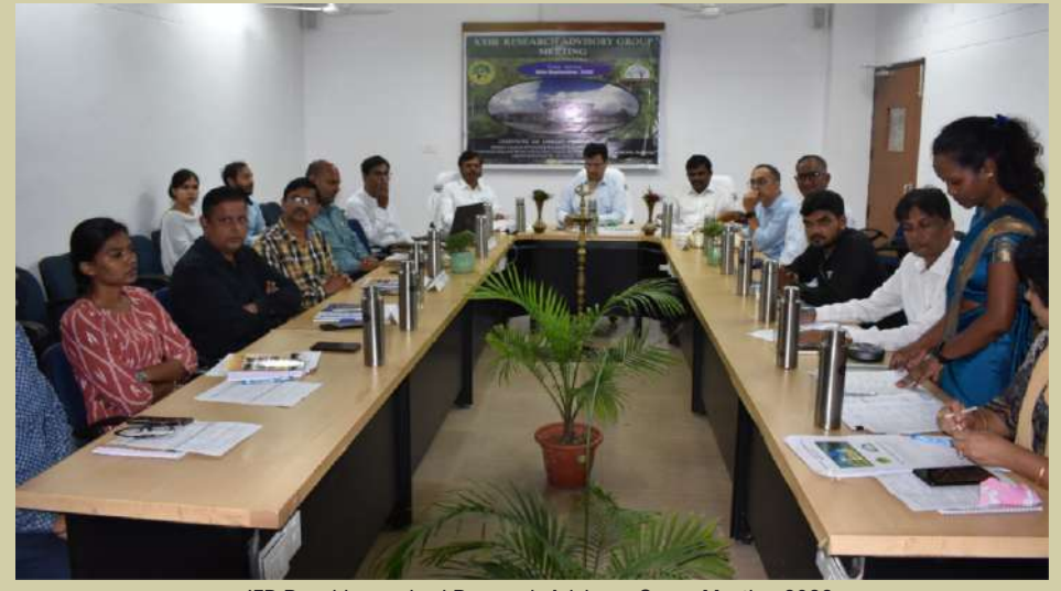
IFP, Ranchi organized Research Advisory Group Meeting 2022