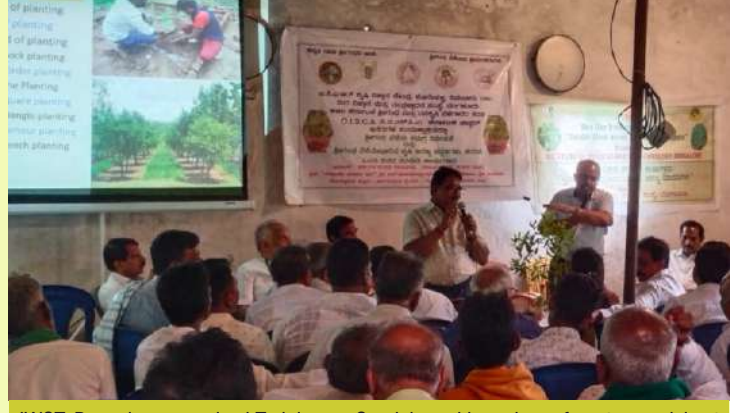
IWST, Bengaluru organized Training on Sandalwood based agroforestry models at Renuka Chandana Vana, Hagalawadi, GubbiTaluk, Tumkur