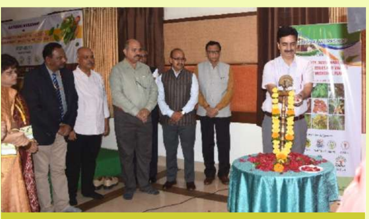
TFRI, Jabalpur organized Seminar on National Workshop on Availability, Sustainability, Processing issues and market linkages of Medicinal Plants