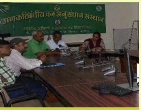
TFRI, Jabalpur celebrated Hindi Fortnight