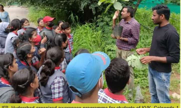
IFB, Hyderabad organized awareness programme for students of KVK, Golconda-1