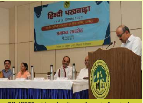
DG, ICFRE addressing the audience in the closing ceremony