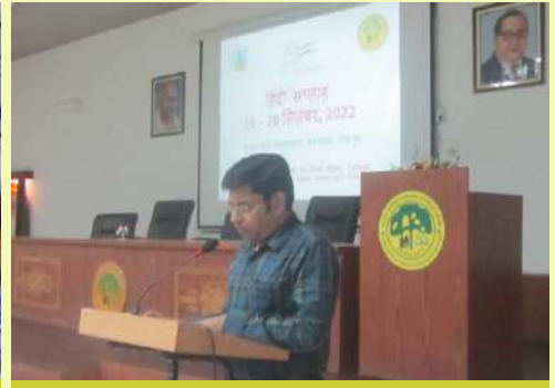
AFRI, Jodhpur celebrated Hindi Week