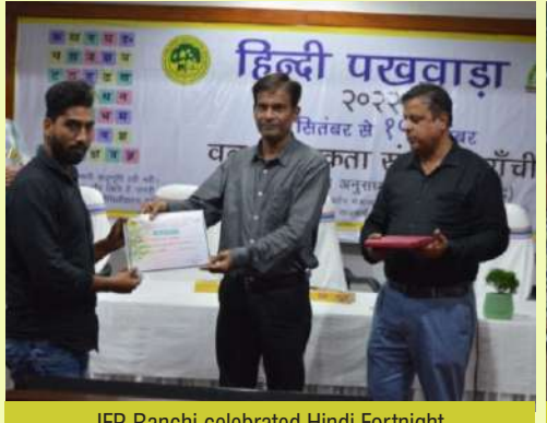
IFP, Ranchi celebrated Hindi Fortnight