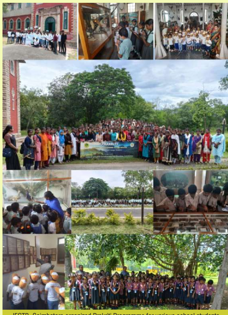
IFGTB, Coimbatore organized Prakriti Programme for various school students

Organized an awareness programme among students of Kendriya Vidyalaya Sangathan, Golconda-1 on 12 September 2022. A total 39 students including teachers participated in the programme.