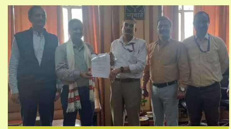
HFRI, Shimla has signed MoU with NABARD at NABARD Shimla, Himachal Pradesh