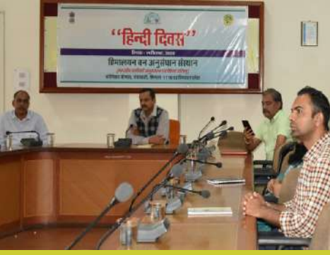
HFRI, Shimla celebrated Hindi Day