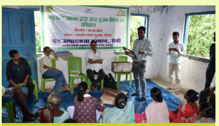
IFP, Racnhi organized organized training programme on Income Generation by Honey Insect Farming