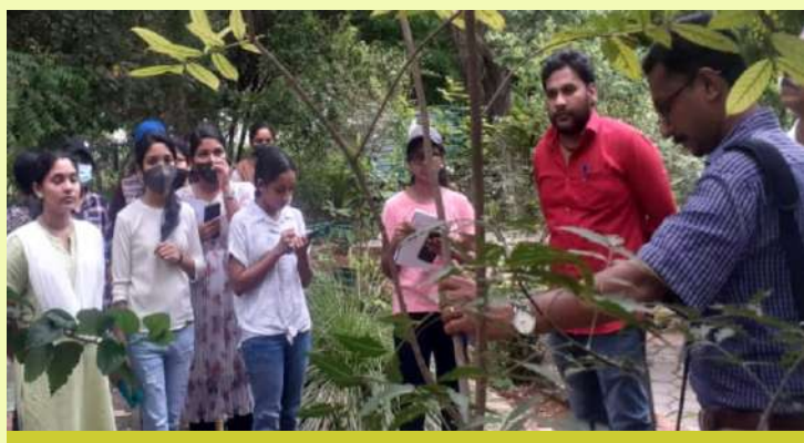
Students from St. Joseph College, Devagiri, Calicut, Kerela visited Botanical Garden of IFGTB, Coimbatore