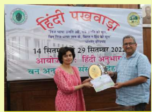
FRI, Dehradun celebrated Hindi Fortnight