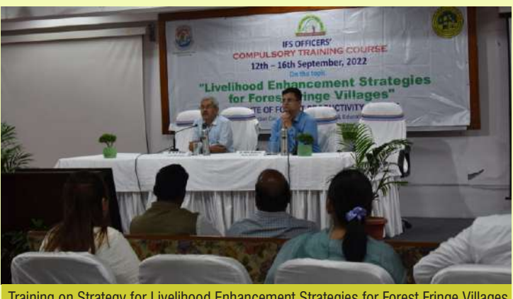
Training on Strategy for Livelihood Enhancement Strategies for Forest Fringe Villages

19 to 23 September 2022 Trainees from various 7. Computer & Internet Application institutes of ICFRE