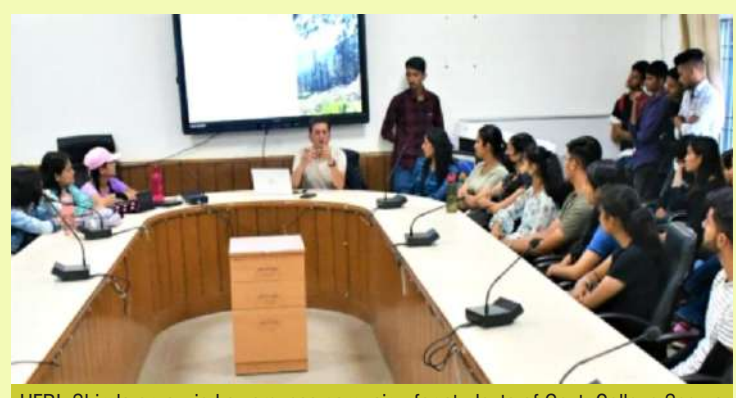
HFRI, Shimla organzied awareness campaign for students of Govt. College Seema