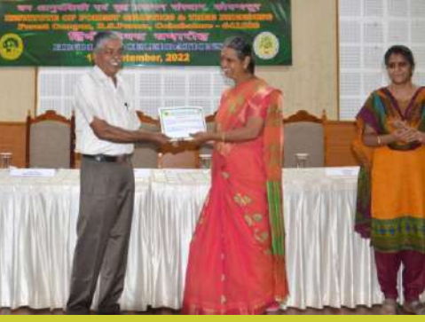
IFGTB, Dehradun celebrated Hindi Day