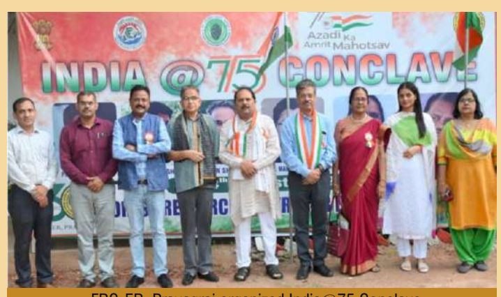
FRC-ER, Prayagraj organized India@75 Conclave