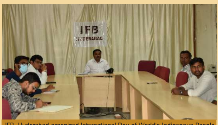
IFB, Hyderabad organized International Day of World's Indigenous People