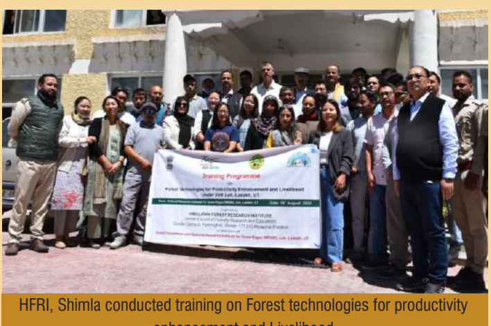
enhancement and Livelihood

ICFRE institutes, Scientists and other Staff from IFP, Ranchi