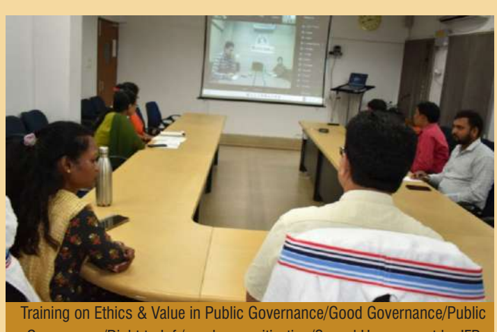
Governance/Right to Inf./gender sensitization/Sexual Harassment by IFP