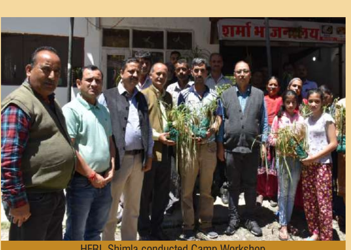
HFRI, Shimla conducted Camp Workshop