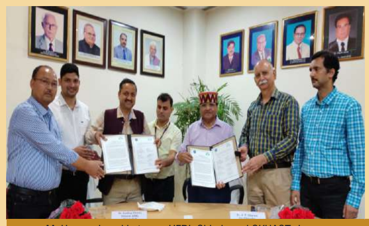
MoU was signed between HFRI, Shimla and SKUAST, Jammu

MoU was signed between HFRI, Shimla and SKUAST, Jammu in the VC office of SKUAST, Jammu on 26 August 2022 for future collaborative Research, Education and Extension activities. Honorable VC, SKAUST termed it as a historic moment and hoped that this will lead to sustainable development of forestry sector and rural livelihood.