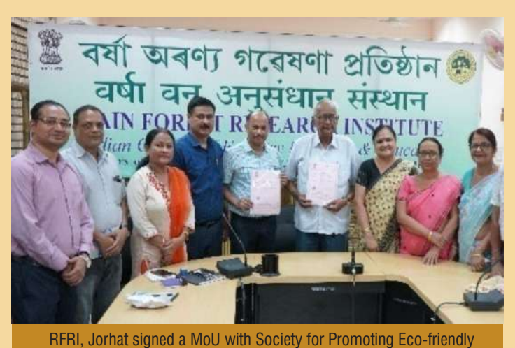
Environment, Assam (ASPEE)