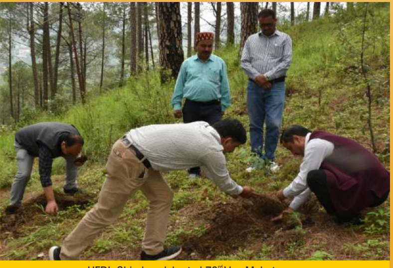
HFRI, Shimla celebrated 73<sup>rd</sup> Van Mahotsav