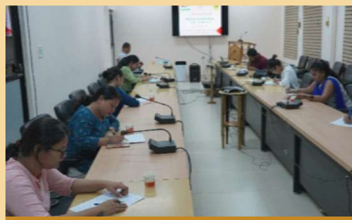
RFRI, Jorhat organized Essay Competition for students