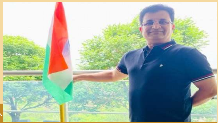
IFP, Ranchi organized Har Ghar Tiranga