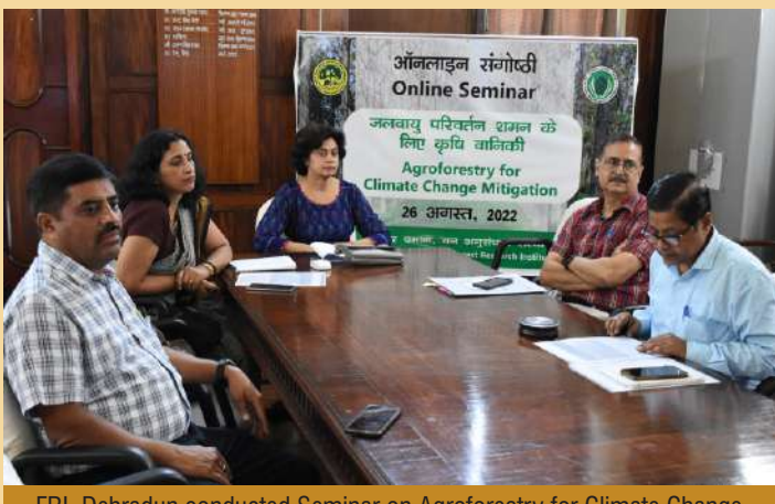
FRI, Dehradun conducted Seminar on Agroforestry for Climate Change Mitigation

Scientists, Officers, Staff & Research scholars of IFGTB