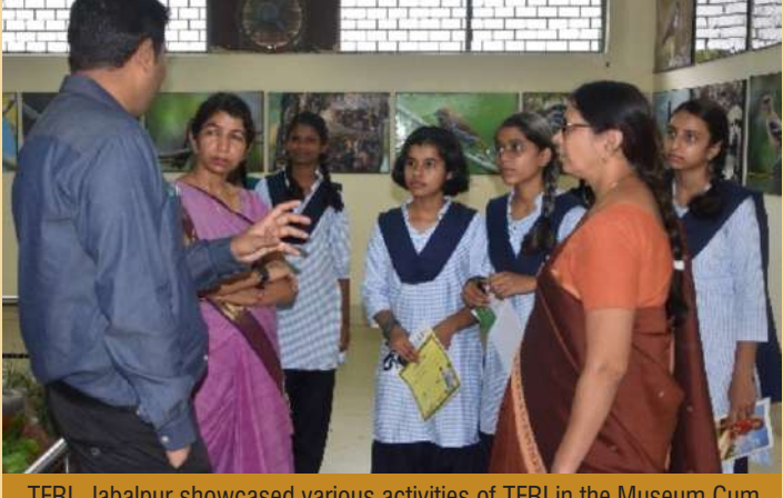
TFRI, Jabalpur showcased various activities of TFRI in the Museum Cum Interpretation center

TFRI, Jabalpur showcased various activities of TFRI in the Museum Cum interpretation center organized for the students of Navodaya Vidiyalaya, Jabalpur on 29 August 2022.