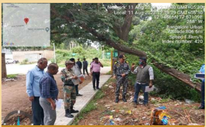
IWST, Bengaluru organized onsite awareness programme on Protection of Trees under Urban Development Projects