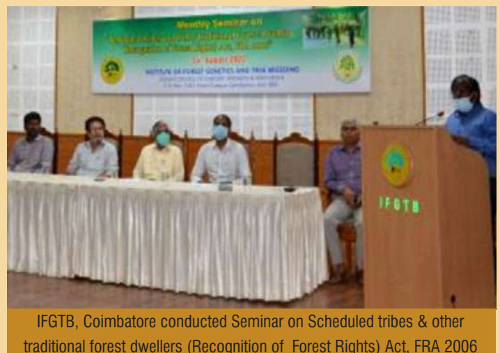
traditional forest dwellers (Recognition of Forest Rights) Act, FRA 2006