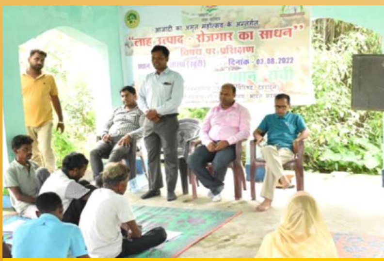
IFP, Ranchi organized a training programme on Lac Products