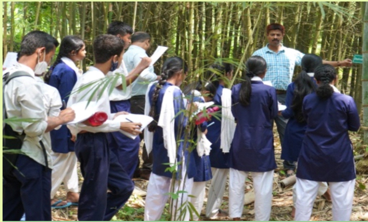
Students of Meleng Provincialized High School, Jorhat visited RFRI, Jorhat

Research and development activities of RFRI, Jorhat, Bamboo Cultivation, Propagation, Nursery Management, Value addition & Bamboo Preservation Techniques, Biotechnology and Tissue Culture, VPI Unit, Banh Bithika, Lac Cultivation, Botanical Garden, Orchidarium, Vermicomposting etc. on 27 April 2022 for Students of Meleng Provincialized High School, Jorhat.