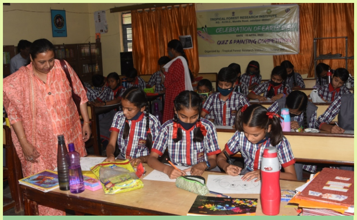
TFRI, Jabalpur organized World Earth Day by conducting quiz and paint