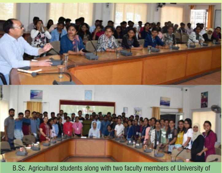
B.Sc. Agricultural students along with two faculty members of University of Agriculture Sciences, Riachur, Karnataka visited HFRI, Shimla