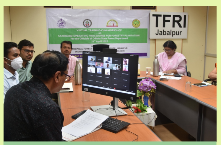
TFRI, Jabalpur organized training programme on Bamboo: conservation and management