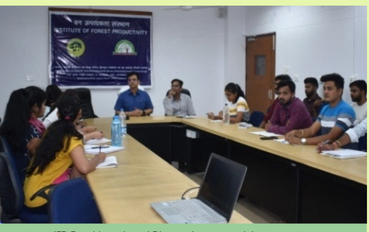
IFP, Ranchi conducted Dissertation-cum-training program