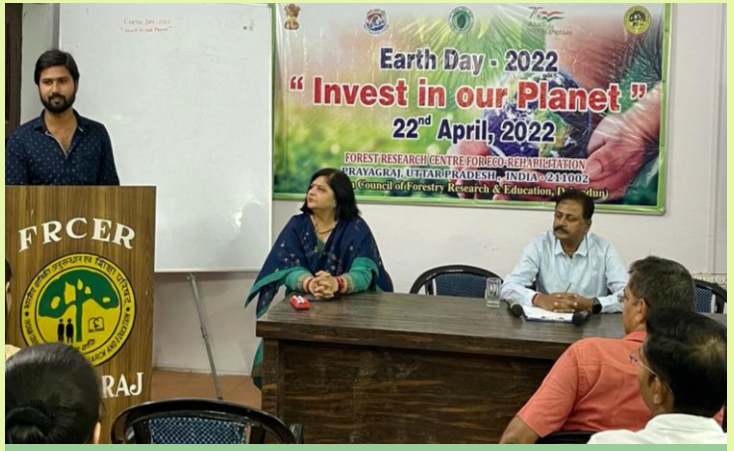
FRCER, Prayagraj conducted a debate competition on World Earth Day