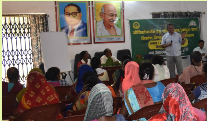
IFP, Ranchi organised a seminar/training programme on Production of Organic Manure for Livelihood Generation