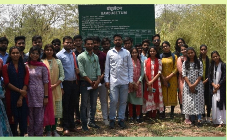
B.Sc forestry students of JNKVV, Jabalpur visited TFRI, Jabalpur

from 18 April 2022 to 21 April 2022 conducted at FRCSD. Chhindwara.