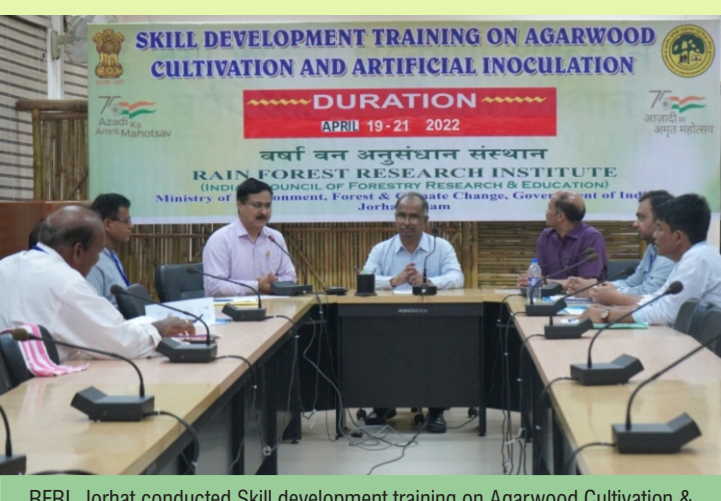
RFRI, Jorhat conducted Skill development training on Agarwood Cultivation & Artificial Inoculation

Officials of Soil and water conservation department under Foundation of MSME Cluster (FMC), Meghalaya state