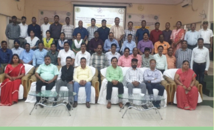
IFP, Ranchi organized training on Standard Operating Procedure (SOP) on Plus Tree Selection and Nursery Techniques