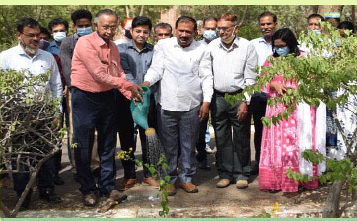
शु.व.अ.सं., जोधपुर ने विश्व पृथ्वी दिवस, Invest in our planet की थीम के साथ मनाया