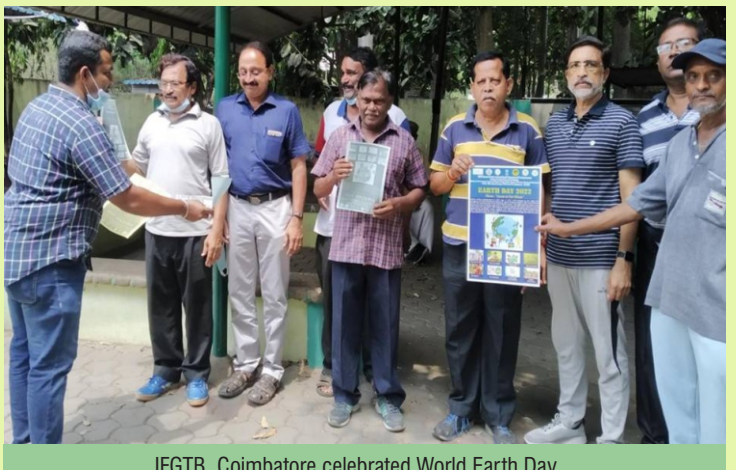
IFGTB, Coimbatore celebrated World Earth Day