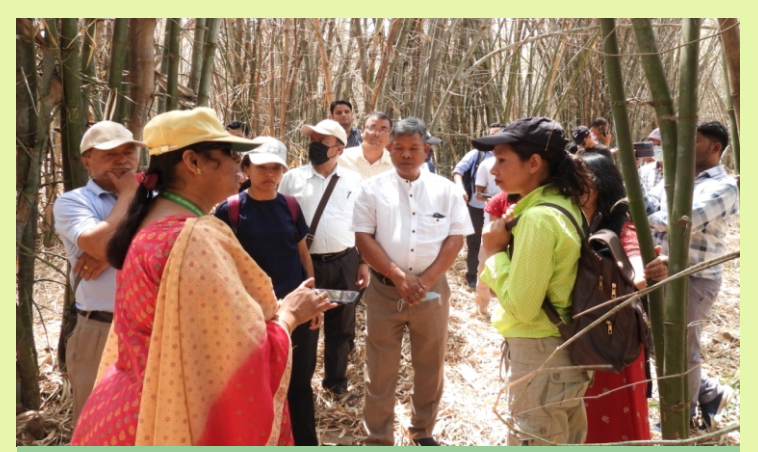
TFRI, Jabalpur organized two days training program on Bamboo: conservation and management