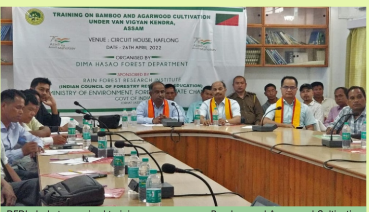
RFRI. Jorhat organized training programme on Bamboo and Agarwood Cultivation