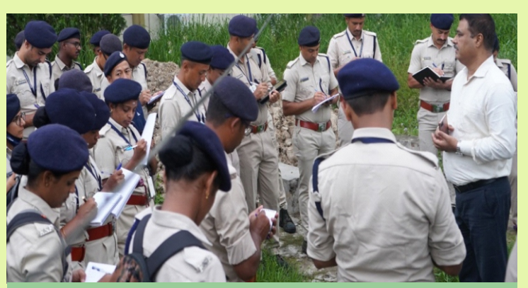
Trainees of Range Forest Officers from Karnataka Forest Academy visited RFRI, Jorhat