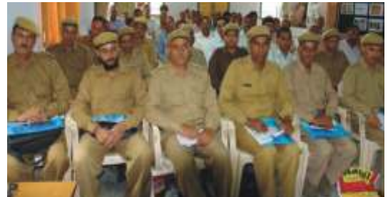
Training on IPM in Hamirpur Forest Division

HFRI, Shimla conducted a one-day training-cum-demonstration programme on