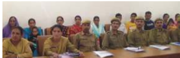
Training on "Forestry Interventions for Eco-restoration of Degraded Land" at Sundernagar (HP)