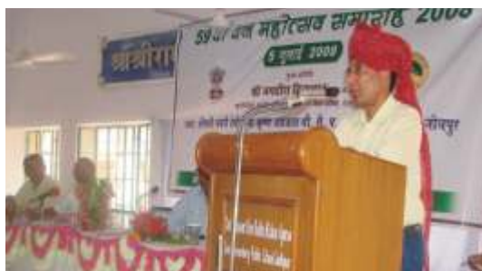
DG, ICFRE addressing at 59 th Van Mahotsav at Bhanwari Devi School, Jodhpur

AFRI, Jodhpur celebrated 59 th Van Mahotsav on 5 th July 2008. Plantation of ornamental tree species was undertaken in a Bhanwari Devi school near Shastri Nagar Jodhpur. Honorable DG, ICFRE, Dehradun was the chief guest on the occasion. TFRI, Jabalpur also celebrated "Van Mahotsav" on 21 st July 2008. Officers and staff of the institute planted saplings within institute campus.