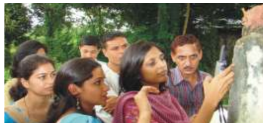
Training on GPS Technology

RFRI, Jorhat imparted training on “Application of GPS Technology” on 19 th to 21 st August 2008.