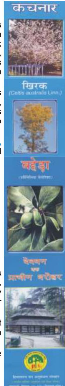
VVK Publications HFRI, Shimla