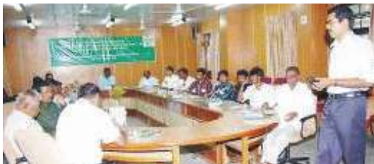
Training Programme on TBOs

IFGTB, Coimbatore organized two days training programme for farmers, foresters, NGOs and others on "Tree Borne Oilseeds (TBOs) with special focus on Jatropha curcas " under DBT funded project on 'Development of Post harvest techniques for seed production in Jatropha curcas ' from 12 th and 13 th August 2008.