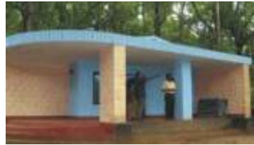
Forest Information Centre, Kuthiran, Thrissur, Kerala

Institute of Forest Genetics and Tree Breeding (IFGTB), Coimbatore has initiated the establishment of VVK in Andaman and Nicobar Islands which will function from Port Blair, Extension Centre, Mangarai, Coimbatore in Tamil Nadu and at the District Forest information and extension centre at Kuthiran, Thrissur in Kerala for display of materials, conducting conferences, workshops and trainings.