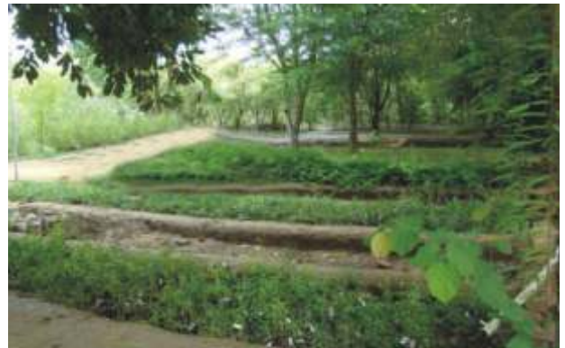
Proposed model nursery site of VVK at Bikaner, Rajasthan

Arid Forest Research Institute, Jodhpur has initiated process for establishment of VVKs in Bikaner (Rajasthan), Rajkot (Gujarat) and Khanwel (Dadra & Nagar Haveli). Area of 25 ha on National Highway-89 has been selected in Bikaner. A progeny trial of Rohida ( Tecomela undulata ) over the area 3 ha (spacing 4 x 4, total plants 1440) has been laid out.