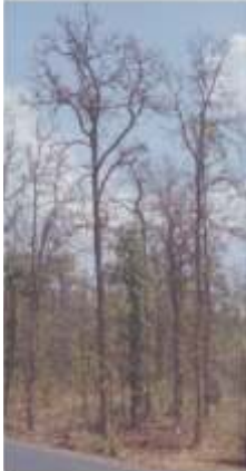
Completely defoliated sal trees

Scientists of Tropical Forest Research Institute (TFRI), Jabalpur noticed a localized sudden outbreak of defoliators spread in 8 compartments of Dhamokhar range of Umaria Forest Division and several neighbouring a compartments of Bandhavgarh National Park during March to July 2008. Most of these compartments remained leafless for 3 to 4 months. The attack was severe in all compartments up to May and gradually slowed down from