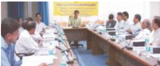
Workshop on "Select International Environment Law Issues and Multilateral Environmental Agreements" at ICFRE, Dehradun

ICFRE, Dehradun organised a two-day workshop on “Select International Environment Law Issues and Multilateral Environmental Agreements” from 9 th and 10 th July 2008 at ICFRE, Dehradun.