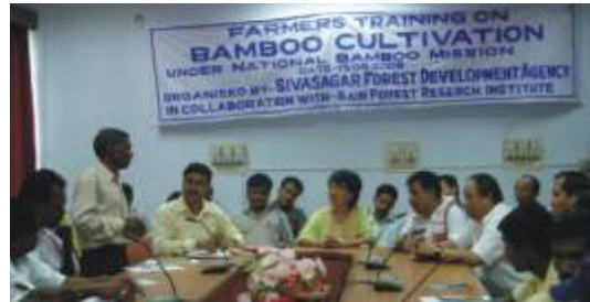
Training on Bamboo Cultivation

Rain Forest Research Institute (RFRI), Jorhat imparted training on 'Propagation and Commercial Cultivation of Bamboo' to the farmers of Forest Development Agency of Sivasagar, Assam at RFRI, Jorhat on 19 th September 2008 and to forest guards of Assam Forest Training School at Makum on 9 th July 2008. Training was also imparted on “Disease Management on Bamboo Plantation” to the farmers and NGO's on 23 rd July 2008 in the district workshop organized by Forest Department of Assam. The institute imparted training on different aspects of bamboo technology at Sikkim Science Centre, Marchak, Ranipool, East Sikkim District on invitation of Department of Science and Technology, Government of Sikkim from 22 nd to 26 th September 2008.