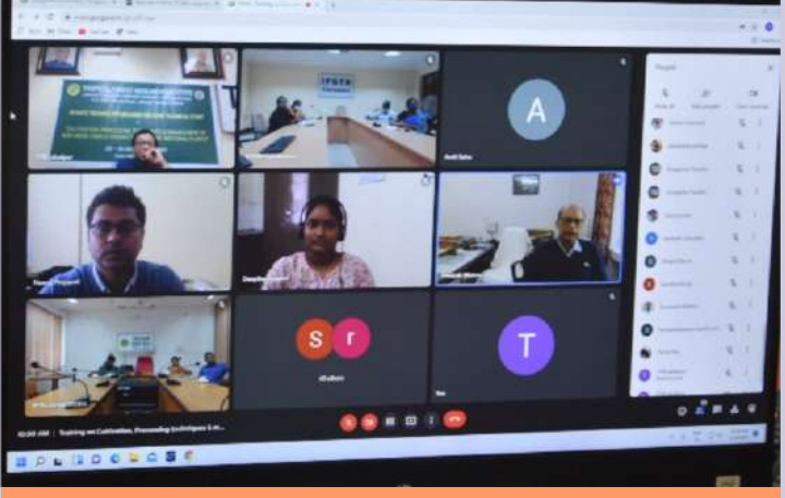
TFRI, Jabalpur conducted training on Cultivation, Processing Techniques and Management of Non-wood Forest Products including Medicinal Plants