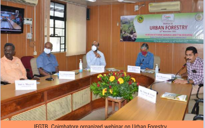
IFGTB, Coimbatore organized webinar on Urban Forestry