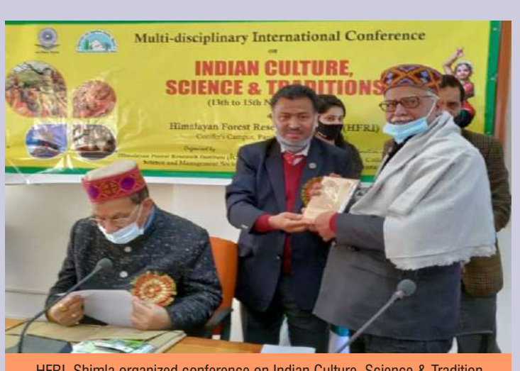
HFRI, Shimla organized conference on Indian Culture, Science & Tradition