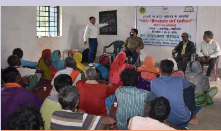
IFP, Ranchi organized a seminar on Bamboo Nursery and Management