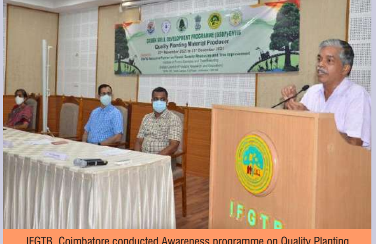
IFGTB, Coimbatore conducted Awareness programme on Quality Planting Material Producer

12. Computer and Internet Application 22 to 26 November 2021 Officers and officials