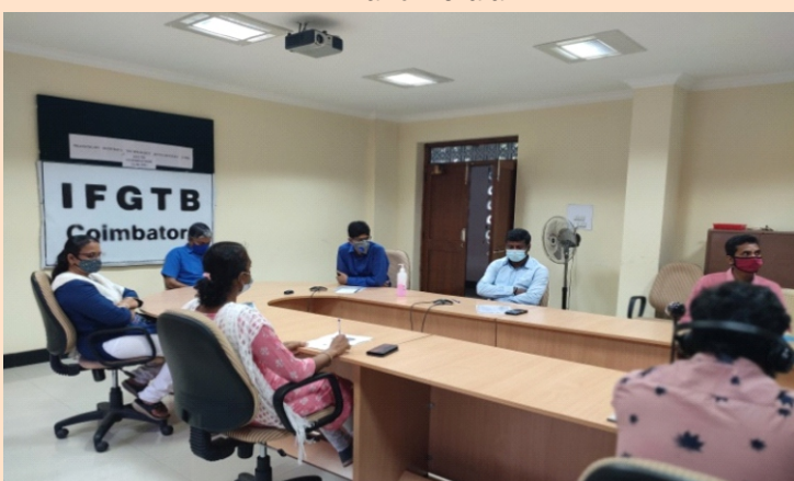
Training on Seed Ball Technology Developed by ICFRE