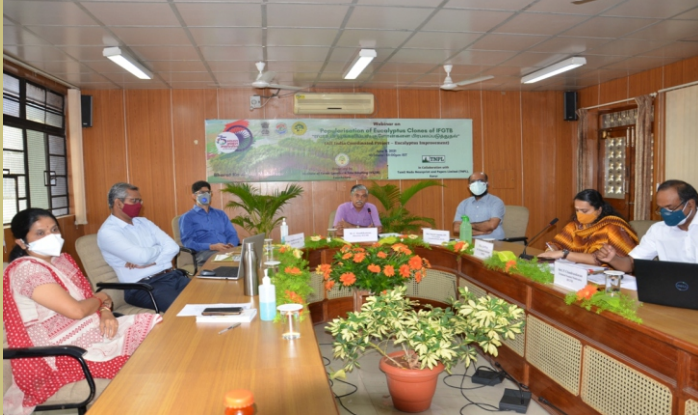
Celebration of "Bharat Ka Amrit Mahotsav" by IFGTB, Coimbatore