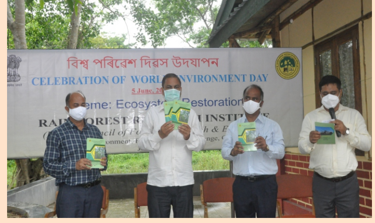
Celebration of World Environment Day at RFRI, Jorhat