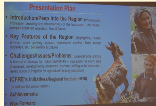
Celebration of "Bharat ka Amrit Mahotsav" by HFRI, Shimla