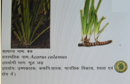
Celebration of "Bharat ka Amrit Mahotsav" by TFRI, Jabalpur