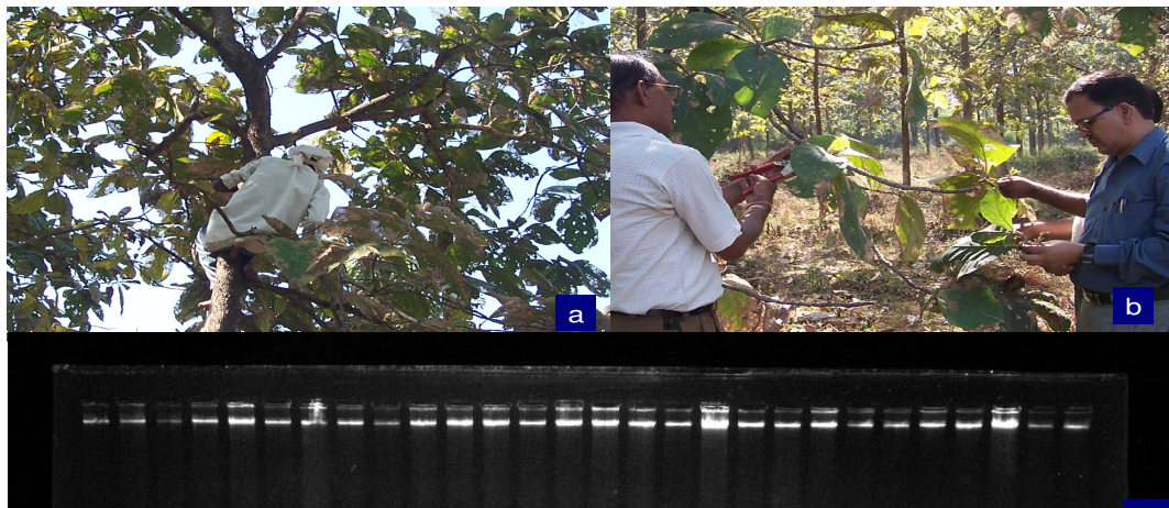
Fig. 2. Progenies of plus trees of teak ( Tectona grandis ): (a), (b) Collection of apical bud of plus tree progenies from the trials and (c) Visualization of genomic DNA of progenies on 0.8% agarose gel.

the quality of DNA (A260 / A280) was 1.74 \pm 0.15 (Range: 1.40 – 1.95 ). The quantity of genomic DNA of progenies ranged from 27.12 \mu\text{g} to 71.34 \mu\text{g} and visualized on 0.8 % agarose gel (Fig. 2c) and the quality (A260/A280) of genomic DNA extracted from apical bud of progenies, from 1.09 to 1.81. STMS primers were designed and tested for amplification and STMS assay for genomic DNA, standardized.