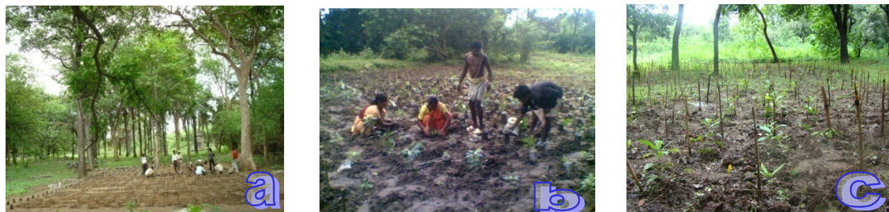
Establishment of multi location field trial at (a) Chandrapur (M.S.), (b) Raigarh (Chhattisgarh) and (c) Jabalpur (M.P.)

The multi-location evaluation of germplasm of R. serpentina was established at Chandrapur (Maharashtra) in July, 2008 (Fig a), Raigarh ( Chhattisgarh) (Fig b) and Jabalpur, (M.P.) (Fig c). These trials were established in randomized block design with three replications. Each accession was represented by nine plants per replication. Observations on the survival of the plants at Raigarh exhibited better survival than the remaining two localities.