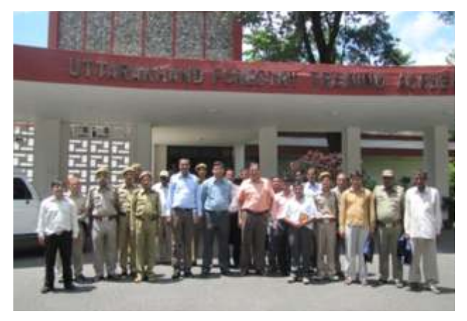
Participants of Agroforestry Training at VVK, Haldwani