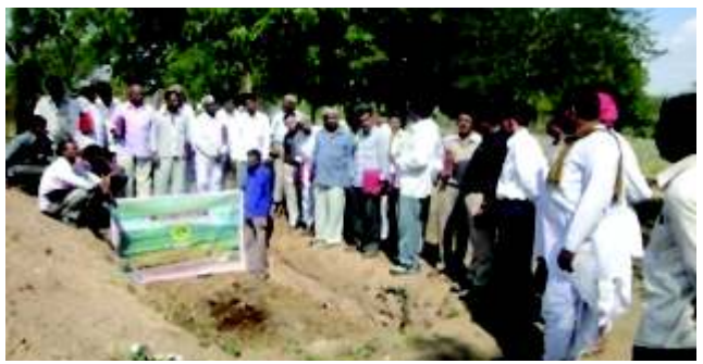
Demonstration of Composting Techniques to the Participants at Experimental Nursery, AFRI on 4th March 2011