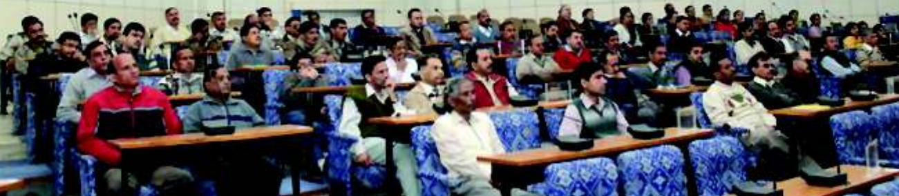
Training a Hindi Software "Saransh" at ICFRE, Dehradun