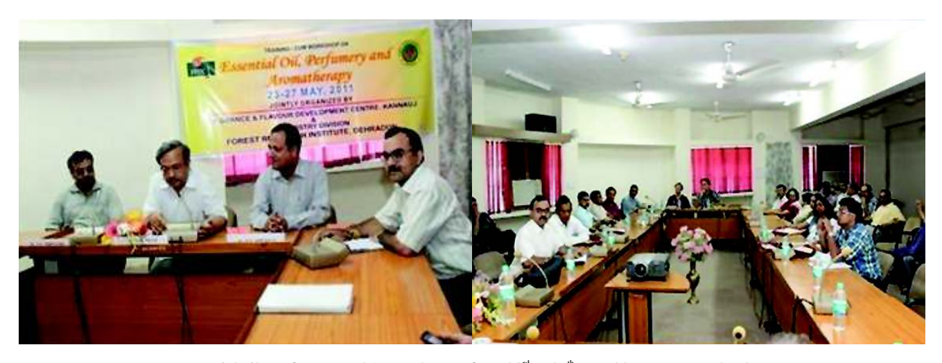
Essential oil, Perfumery and Aromatherapy from 23<sup>rd</sup> to 27<sup>th</sup> May 2011 at FRI, Dehradun