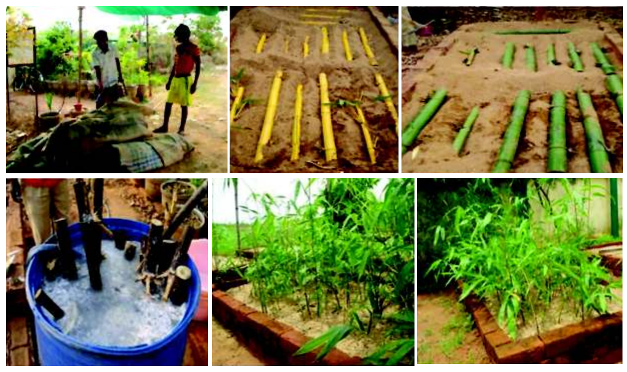
Bamboo Propagation Practice & Demonstration

and environmental scientists. Therefore, there is urgent need to restore soil quality, health and resilience for food security and environmental security with the help of organic manures. Organic manures such as compost, verimcompost etc., not only supply macro and micro-nutrients but also improve physical, chemical and biological properties of soil for sustainable agriculture. In Jharkhand, Gumla, Logardaga and Lathehar districts are one of main farming areas, where availability of organic materials is high. While keeping all points in mind, IFP, Ranchi established a Vermicompost Unit at Demo- village, Hapamuni, Gumla with dimension of 70' X 30' X 7.5' @ ` 1,85,929/to impart training-cum-demonstration to the farmers and to establish demovermicomposting farms. The Vermicomposting unit includes vermicomposting beds, decomposting tank and vermiwash collection tank. Agricultural wastes, weeds, and farm yard manure are raw materials for vermicompost production. The production capacity of the unit varies between 3-4 tonnes/