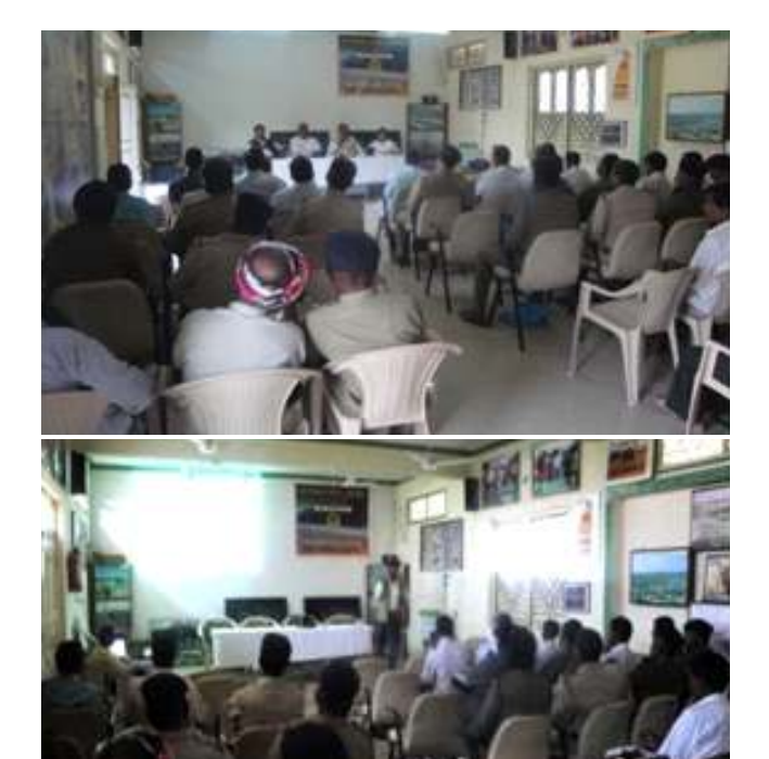
VVK training at Van Chetana Kendra, Bhuj on 14<sup>th</sup> December 2010

forestry extension and organic farming and composting techniques. Training was organized by delivering lectures and onsite demonstration. During the field visit, the participants learned the advanced techniques through demonstrations of vegetative propagation of tree species, vermicomposting at Hi-tech nursery, Bhuj, guggal plantation and nursery, Vandai. VVK training participants also visited silvi-pastural model developed by the AFRI at Mocharai, Bhuj.