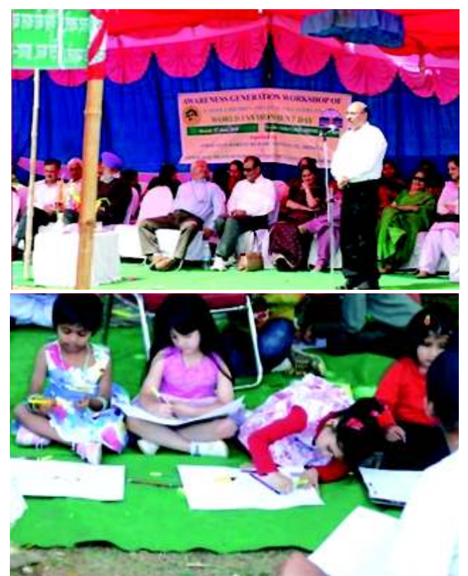
Celebration of Wold Environment Day at Potter's Hill, Shimla

of NGOs. About 150 school children from various schools alongwith their teachers and villagers from nearby villages participated in the activity. For encouraging the school children, competitions like Quiz Competition, Declamation contest, Slogan writing and Drawing/ painting competition were also organized by the institute.