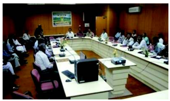
Demo Village Training Inauguration at AFRI, Jodhpur on 4th March 2011