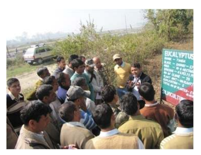
Training on GPS Under VVK Training Programme