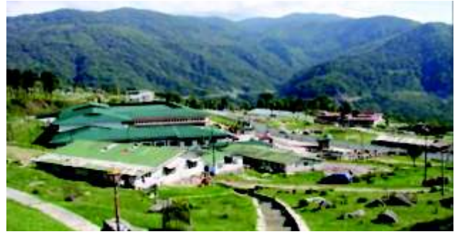
View of Settlement in Study Region in Bhutan

1. Comprehensive EIA and EMP study for Bhunakha hydroelectric project in Chukha Dzongkhag District in Bhutan by Tehri Hydro Development Corporation India Limited (THDC).