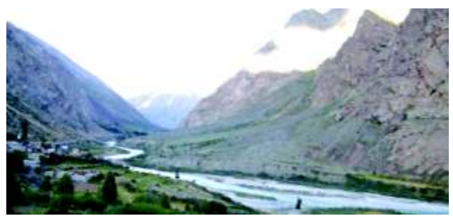
Gyspa Project Site, HP

2. Comprehensive EIA studies and formulation of EMPs for Gyspa (300MW), Nakthan (141 MW) and Beri Nichli (78MW), Thana Plaun (141 MW) and Surgani Sundla (42 MW) in Himachal Pradesh by Himachal Pradesh Power Corporation Limited (HPPCL).