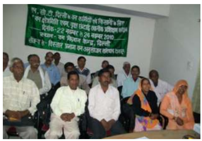
Training on forest mensuration and tree pruning techniques at VVK, Delhi