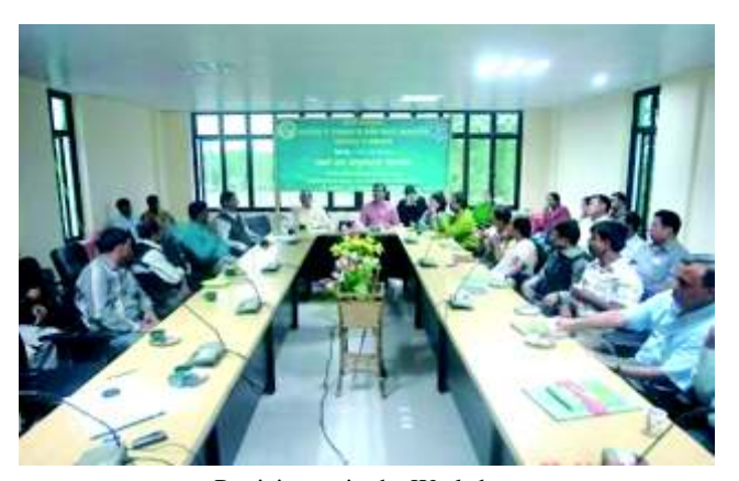
Participants in the Workshop

• A workshop entitled "Use of Hindi in the Computer" was organized on 4<sup>th</sup> March 2011 in the Biotechnology & Genetics Division. Special emphasis was given on the practical use of Hindi in the day to day official works.