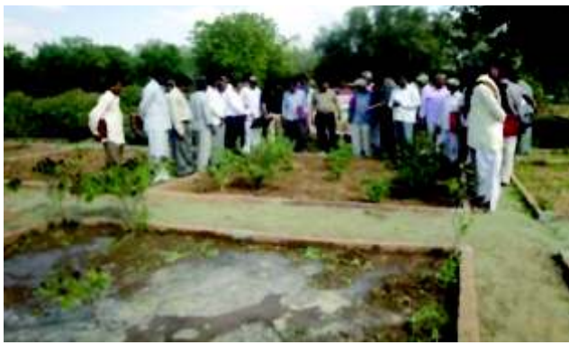
Demo Training Participants Visit to Medicinal Garden at Nursery, AFRI on 4<sup>th</sup> March 2011