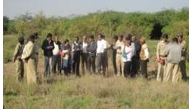
VVK Training Participants Visiting AFRI Developed Silvi-pastural Model at Mocharai, Bhuj on 15th December 2010

Maintenance works of Hi –Tech nursery, Chhipardi Beedi, Rajkot have been executed. Garden pipe, fogger and accessories, fertilizer and insecticide were procured for the Hi-Tech nursery.