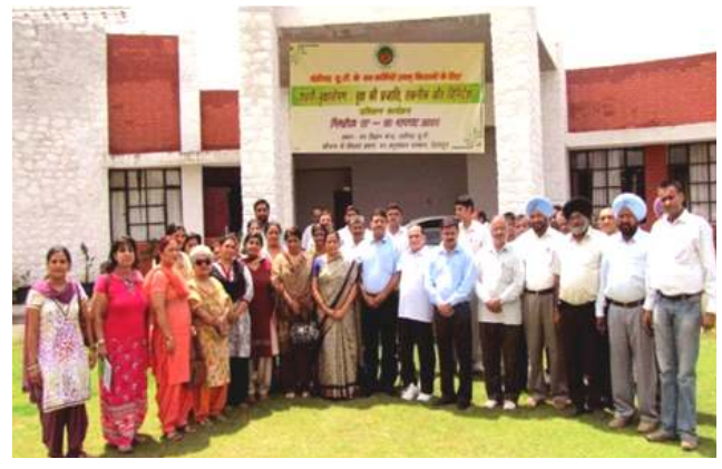
Training on Urban Forestry at VVK, Chandigarh