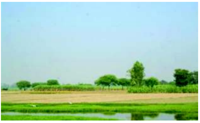
Cultivated Agriculture Land with Agri- Crops and Water Bodies