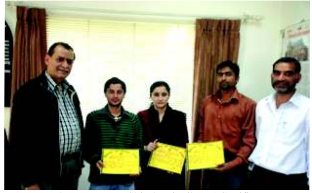
Director, HFRI, Shimla Distributed Certificates to the Winners of Essay Writing Competition

Hindi Diwas on 14<sup>th</sup> September and Hindi fortnight from 13<sup>th</sup> to 26<sup>th</sup> September was observed in the institue. Different competions were organised during the fortnight and the certificates were provided to the winners.