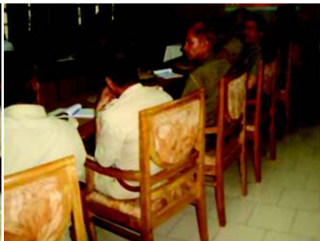
Demonstration of Dye Extraction and Dyeing Technology to SFD Punjab Officials and NGOs