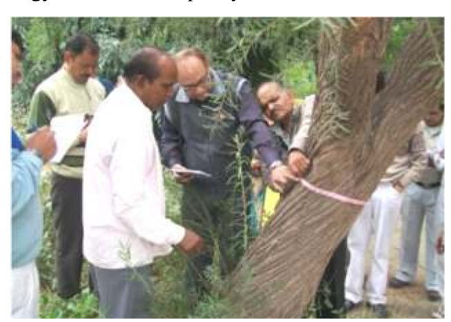
Field Demonstration During Training on Forest Mensuration at VVK, Delhi

A training and demonstration programme on "Challenges and Prospects of Forestry" was organized from 23<sup>rd</sup> to 25<sup>th</sup> January 2011 at Van Vigyan Kendra, Kanpur by CSFER, Allahabad.